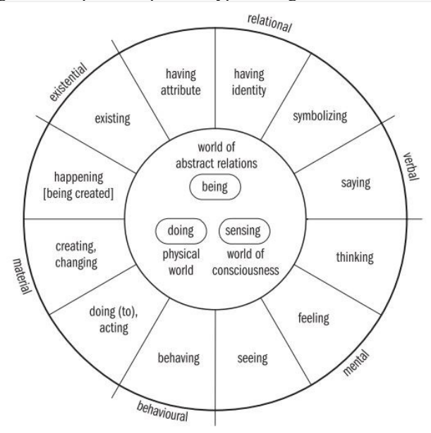
Fig 1. Types of process in English (Halliday & Matthiessen, 2014, p. 172)

There are three basic process types in ideational metafunction, yet it can be expanded into six (Halliday & Matthiessen, 2014)<sup>16</sup>. They are material, mental and relational process. The expansions are behavioral, verbal, and existential process. They appear because of the intersection between the basic process types. Behavioral is between mental and material process. Verbal is between mental and relational process, and existential is between material and relational one. Figure 2.4 depicts the process type in English.