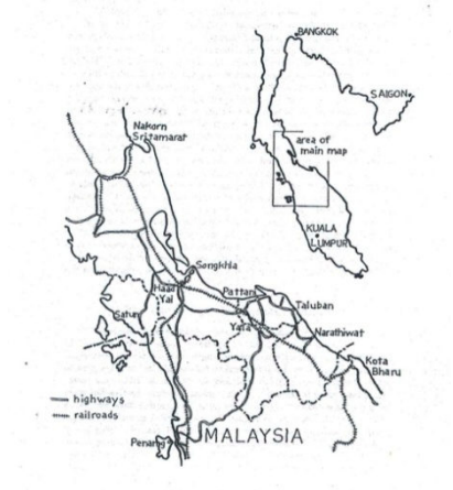
Figure 1 Map of the 3 provinces affected by the unrest: Pattani, Yala and Narathiwat. Source: Aphornsuvan,T.(2003), History and Policies of the Muslim in Thailand [Online] Available <u>http://seap.einaudi.cornell.edu/system/files/MuslimThailand.pdf(March</u> 8, 2012)

Table 1 Cumulative number of deaths and injured by religion from January 2007 to October 2011.