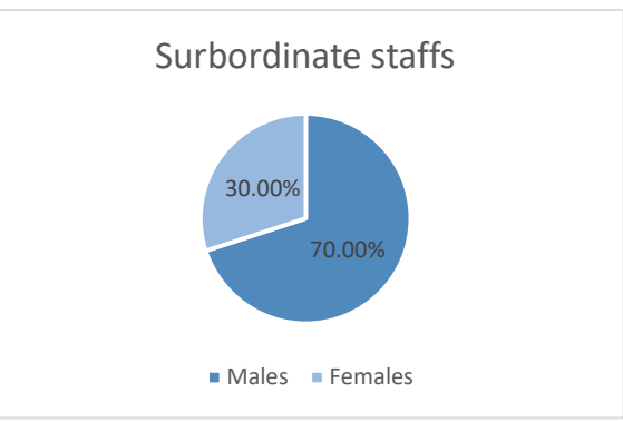
Figure 1: Gender of Cashiers and Subordinate Staffs