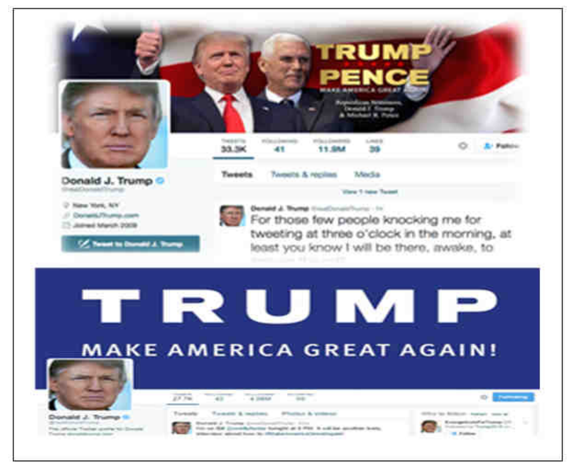
Fig. 3. Donald Trump Twitter page (Alfred, 2016)