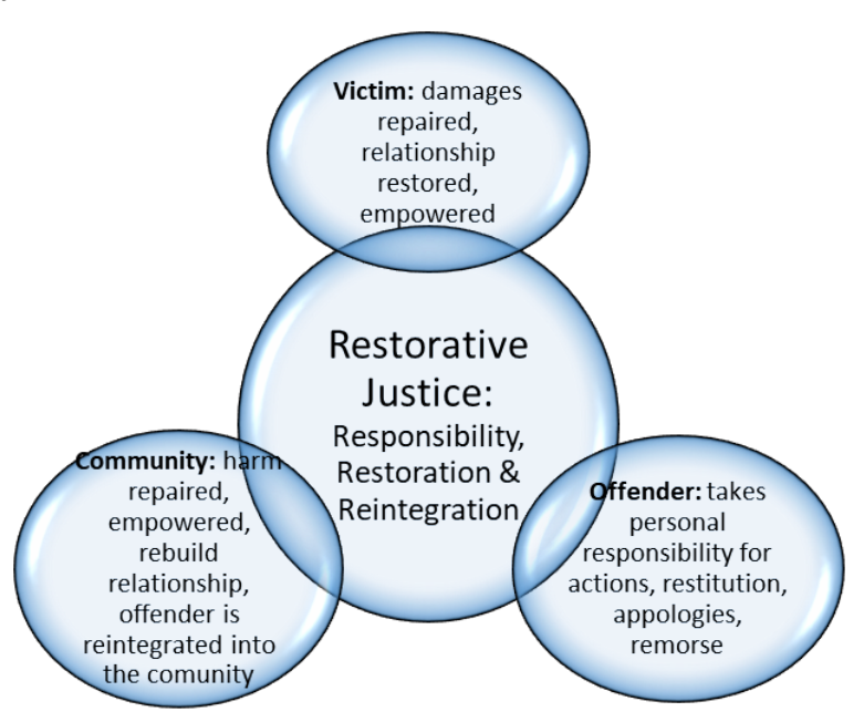
Figure 2. Core Elements of Restorative Justice. Adapted from Miers, et al., (2001); Maglione, (2020).

The philosophical elements of Restorative Justice are interconnected in a circle of justice and can be summarized in three R's : Responsibility, Restoration and Reintegration (Miers et al. 2001). It provides for offenders' accountability by encouraging offenders such as terrorists to take personal responsibility for acts of killings, arson, demolition of properties, rape, hostage taking and kidnappings. Restorative justice addresses the root causes of terrorism such as religious extremism, bad government, socio-economic marginalization, poverty, unemployment, economic marginalization, power struggle, lack of education, advancement in technology (Crelinstein, 2014; Rapoport, 1984; Omede, 2011; Crenshaw, 1981). It embraces mediation, peace keeping, cooperation, reconciliation, repairing harm and rebuilding relationships rather than coercion and retribution. As provided above, it empowers victims and affected community through the process of justice and show equivalent concern for their needs. All stakeholders including family members of terrorists' victims, bereaved family members and all others affected by terrorism attacks have equal opportunity to dialogue with victims, offenders and mediators. It is expected that the outcome will repair wrongs and reintegrate offenders (terrorists).