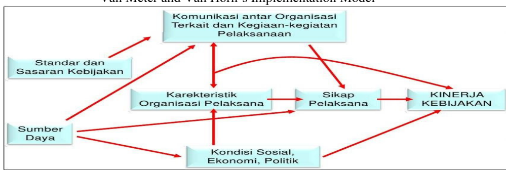
Figure 2.1 Van Meter and Van Horn's Implementation Model

Policy implementation intentionally carried out to achieve high performance occurs in the interrelationship of various factors and is developed in a policy implementation model that consists of six variables believed to form the relationship between policy and policy performance: (1) policy standards and objectives, (2) policy resources (funds and other incentives), (3) communication between organizations and measurement of activities, (4) characteristics of executor agencies (such as staff size, level of hierarchical oversight, organizational vitality), (5) socio-economic and political conditions, and (6) the attitude of the executors;