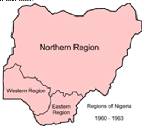
Figure 1. Map of Nigeria as at 1960 with 3 regions.

Nigeria gained independence from Britain on the 1st of October 1960 as a federation consisting of 3 regions namely, the Northern region, Eastern region and the Western region. Figure 1below, shows the geographical map of Nigeria as at that time.