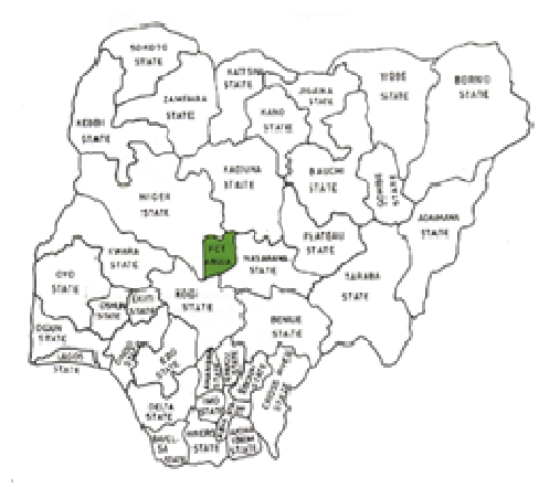
Figure 2. The current Map of Nigeria showing 36states and the FCT.

Several military regimes have sought to restructure the country by dismantling the regional structure that was so central to ethnic political contestation. Clear efforts were also made to address minority complaints. The result has been a continued process of state creation, from 4 regions in 1963, to 12 states in 1967, to 19 states in 1976, to 21 in 1987, to 30 in 1991 and finally to 36 states in 1996 which was the last time a state was created in Nigeria. During the same period however, the local government which is the 3rd tier of governance in the federation, increased from about 330 to 775. However, the cries and feelings of marginalization lingers.