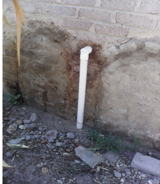
Fig 4: Outside/Backside of an Ecological Sanitation Toilet in Victoria Ranch Picture taken by one of the researchers, 21 February 2015

Although residents used ash to neutralise smell from the toilets a significant number of respondents said the toilets were not free from smell.