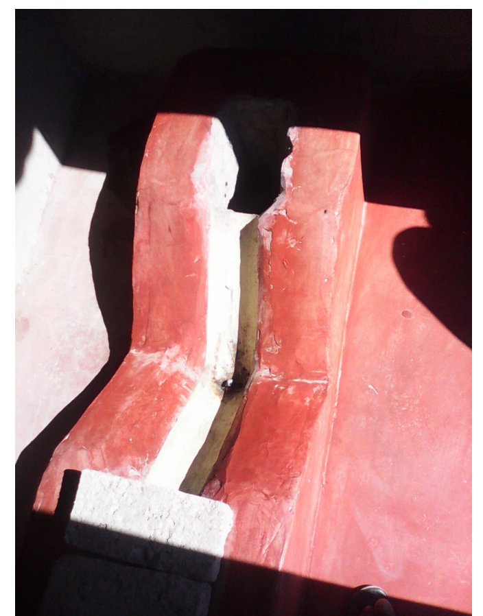
Figure 5: Separate Faeces and Urine Ways of the Ecological Sanitation Toilets Picture taken by one of the researchers, 21 February 2015

One of the respondents said, 'The toilets do not smell anymore. Our only worry is these big flies. Perhaps we are so used to the smell that we cannot sense it anymore'. Thus, most of the toilets attracted a lot of flies, especially at houses where there were more than one household. The situation was worse where there were children. Most of the toilets could be described as poor (see Table 5). Also the cleanliness of both the inside and outside of the toilets was an issue of concern. Because of the smell issue and poor maintenance of the ecological sanitation toilets some people opted for open defecation in the nearby bushes as already observed above. This made the vicinity and the surrounding bushes unfriendly as there were faeces and urine all over.