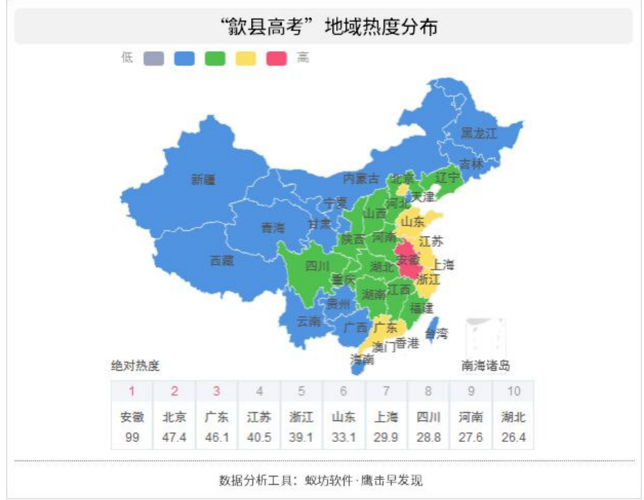
Figure 2. Regional Heat Distribution on July 7

The college entrance examination in Shexian County is a postponement in the process of postponement. The sudden and unprecedented particularity of this event has brought it heat and concern. Through the analysis of the public opinion monitoring system, it can be seen that on the first day of the college entrance examination on the 7th, the absolute heat of Anhui reached 99, ranking first in the country and far exceeding Beijing and Guangdong, the second and third places; It can be seen that the netizens in Shexian County, where the public opinion took place, paid close attention to this matter. The postponement of the college entrance examination was closely related to the interests of local examinees. The popularity of the college entrance examination in Shexian County reached a climax in this stage.