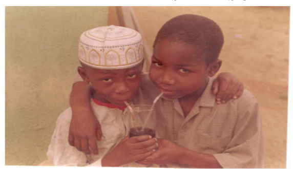
Love and respect among children of different religion