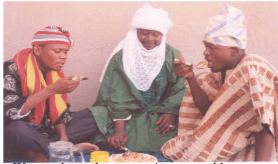
We stand together as one in trust and love