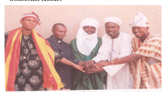
United leaders bounded in trust and unity