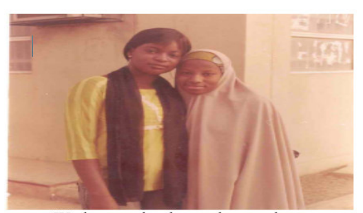
We love each other and created as one