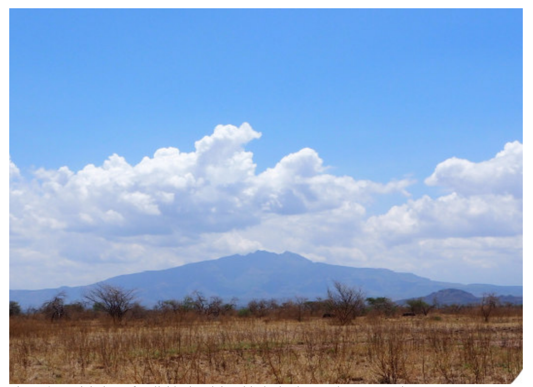
Figure 2: partial view of Hallaideghe plain with the background Mount Asebot