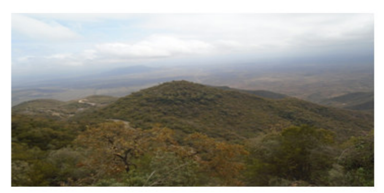
Picture 6: Churches and topography with forests at Mt. Asebot