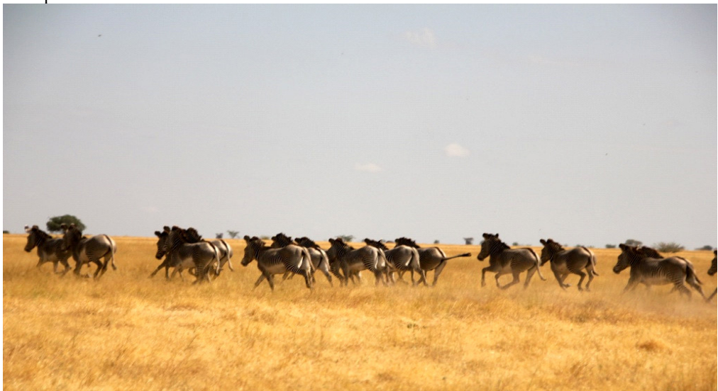
Figure 3: Grevy's Zebra

The national park is primarily known for its population of Grevy's zebra (Figure 3) that thrived on the extensive perennial grass lands (Fanuel, 2012). Information obtained from the national park office indicated that More than 32 large mammal species are recorded in the park excluding bats and rats. Large mammal species include Beisa Oryx, Soemmering's Gazelle, gerenuk, lion, leopard, cheetah, black-backed Jackal, Bat-eared fox, common Jackal, spotted hyena, aardvark, tree climbers and others. According to Fanuel Kebede (2012), the Hallaideghe grass land plain harbors the largest populations of Grevy's zebra, Soemmering's Gazelle and Beisa Oryx in Ethiopia.