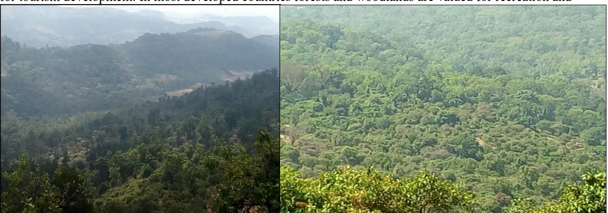
Figure 4.1: Photo of Kehitaste Forest; Source Author's own photographing, Feb. 2019

In contrast to the exploitation which occurred in the past, the world's forest resources deserve special function for tourism development. In most developed countries forests and woodlands are valued for recreation and