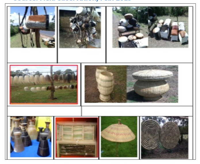
Figure 4.6: Handcrafts; Source: Field observation, Feb. 2019