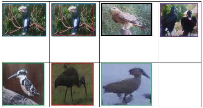
Figure 4.3: Some of bird species (Horn bill, Abyssinian rapax, Abyssinian ground horn bill, wood picker, water bill, Hammer kop; Source: Author's Field observation, Feb. 2019

The real world of wild life can be observed although it needs patience and long hours to get the chance to photograph them since some of mammals run and escape when see human, some others also jump from top of high ceiling trees to trees. Concerning to Bird species, they are abundantly observed with different attractive colors and their characteristics. One can observe them when flying from place to place, dancing, hunting, collecting food, eating, feeding their offspring, shouting and singing cheerfully, making living house and doing other different activities.