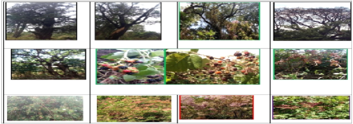
Figure 4.2: some of attractive potential plant species for ecotourism (Juniperus procera, Olive, Prunusafaricanus, Schefflerabyssinica, Ficussur, Strawberry, Embeliaschimpri, Rosaabyssinica, Emboch, Kokesfuchi, Endod) Source: Author"s photograph, February 2019

However, some flora species have not given common name names. Such flora species with local names include sasa/hantsini, bahusti, shagimbi, thatsi, ensat/emparpari, Kulkuli, Girawa/huhitsi, awidi, galmatsi, zegristi, hohasfuchi, sharanga/niwri, entat/antwi, merkidi, abbra/ababri, tiksi/tihitihitsi, kenebari, dinkifi, empahipahi, takatiya, simbitibit/simbitibti, awiri ahara, gashini ahara, enkiki ahara, and etc.