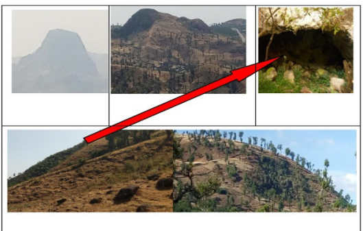
Figure 4.4: Some of impresive land scapes (Fudi Mountain, Brasti LandScap, Nana Cave and Didma High Plateau respectively); Source: Field observation, Feb. 2019

These Physical features of land and sea are unevenly distributed throughout the world which has important implications for climate variation, population distribution, economic development, and communication. The land surface of the earth is composed of a variety of landforms which are potential resources for tourism development. Mountain ranges are found in every continent and attract many tourists interested in sightseeing. This is due to the variety of scenic features, including spectacular mountain peaks, glaciers, cirques, lakes and waterfalls, as well as the crisp clear air which encourages a range of activity and adventure holidays. Most of these involve limited numbers of visitors and are the concern of "niche" tour operators dealing directly with their customers. (Stephen William, 2009).