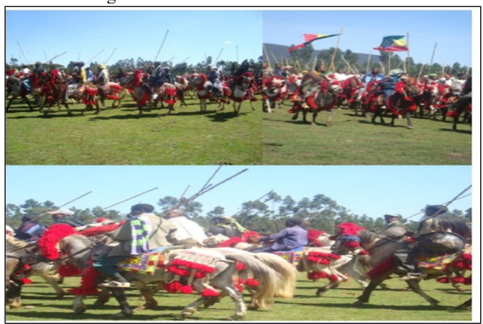
Figure 4.5: Horse Riders celebrating the Festival

resources into CBET and attract domestic and international tourists to get benefit in different aspects- they can get economic benefit from supply of cultural tourism products and services; they can upgrade social activity; ultimately, they can conserve their original culture.