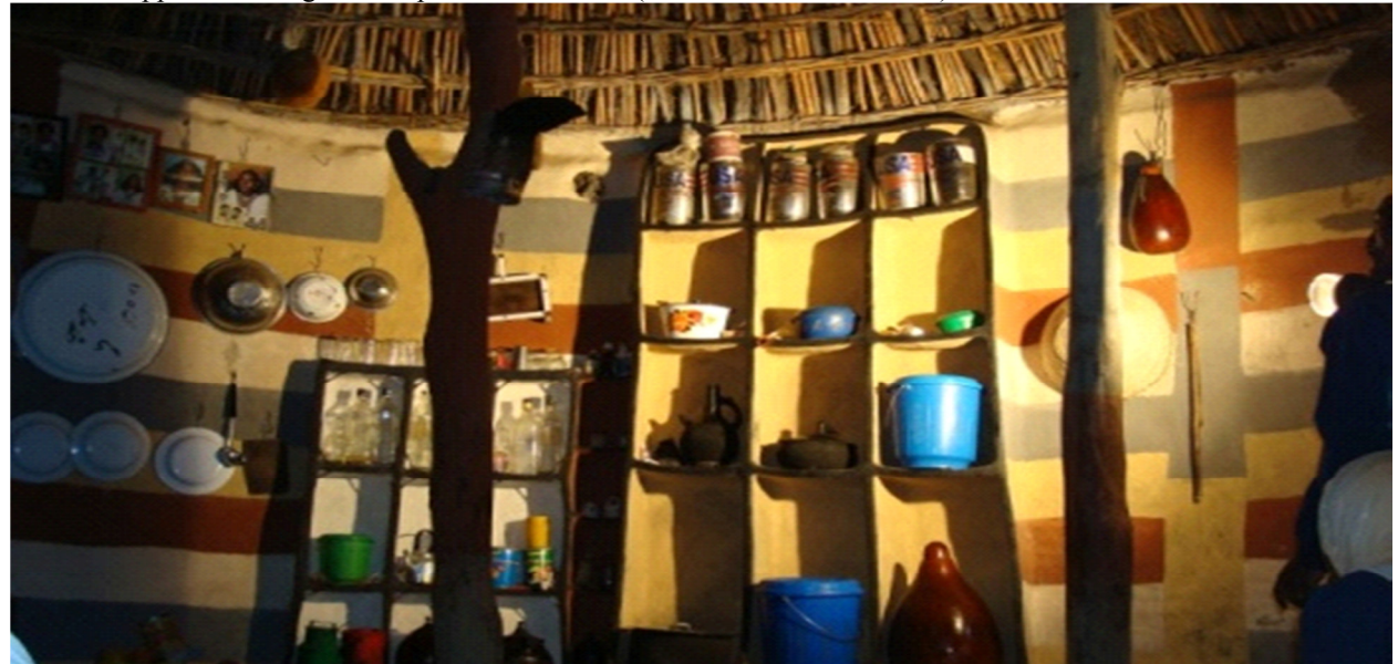
Figure 8: Indigenous cultural heritages materials found at the local house of the communities and used for Ashendye festival

It is another basic issue of the festival for cultural tourism development. There are many heritage materials in each household. Most of the local communities are using the ancient heritage materials for daily purpose. There is a great problem of conserving such ancient heritage products and modernization is trying to substitute such products through the fashion and modern instruments. Most of the respondents agreed that lack of commitment is one of the series issues among the local community, the local government and private sectors. This critical issues is supported through the respondents with the (M=4.0818 and SD=0.62).