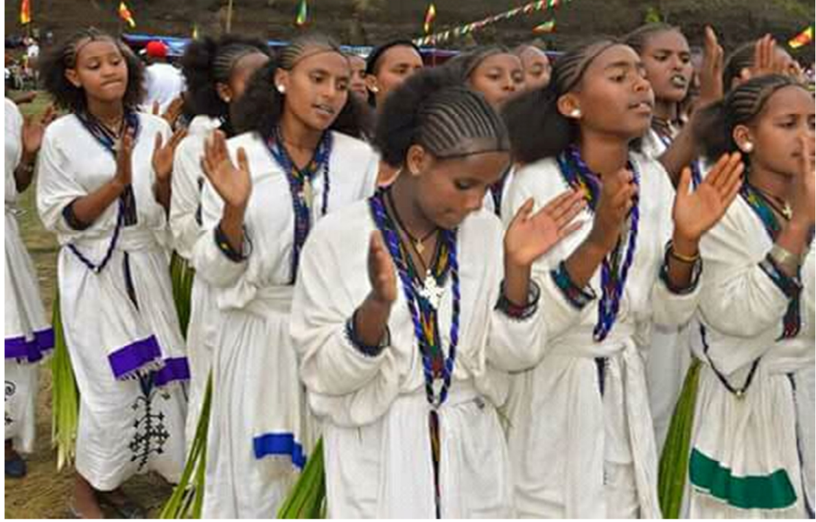
Figure 3: the female's cultural music at Ashendye festival Source: Author's own, 2018

The (M=4.7 and SD=0.5) indicates, the historical and cultural values of Ashendye festival for cultural tourism development. The aggregate response from the interview also support that its long history and its wide varieties of cultural activities enable the festival provides opportunity for cultural tourism development. The determinant character of a historic area can assert itself in its intangible significance. Intangible cultural heritage of historic areas consists of three aspects: Firstly, the whole pattern of the area which is what makes the area to be itself; Secondly, the life of inhabitants, which makes the area living; thirdly, traditional handicrafts, folklore, drama and the like are derived from the historic area. Intangible cultural heritage must be made embodied in cultural manifestation, in visible signs, if it is to be conserved and this come to be true through festivals (Jean-Louis LUXEN, 2003).