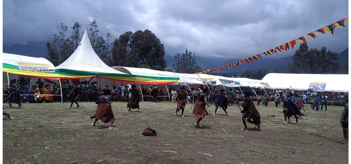
Figure 7: Males transmit indigoiuns traditional game with Lash at the festival

The Ashendye girls, in their songs, raise a lot of issues like social life, politics, wishing new hope for the communities, philosophies, norms, raise the challenges of the community, creates awareness on the values of conserving the cultures for cultural tourism development. Ashendiye is used as a social gathering tool and its songs as a communication strategy to convey selected socio-economic issues such as gender equality, ecotourism development, anti-HIV/AIDS awareness creation and the like (LTCTO,2015).