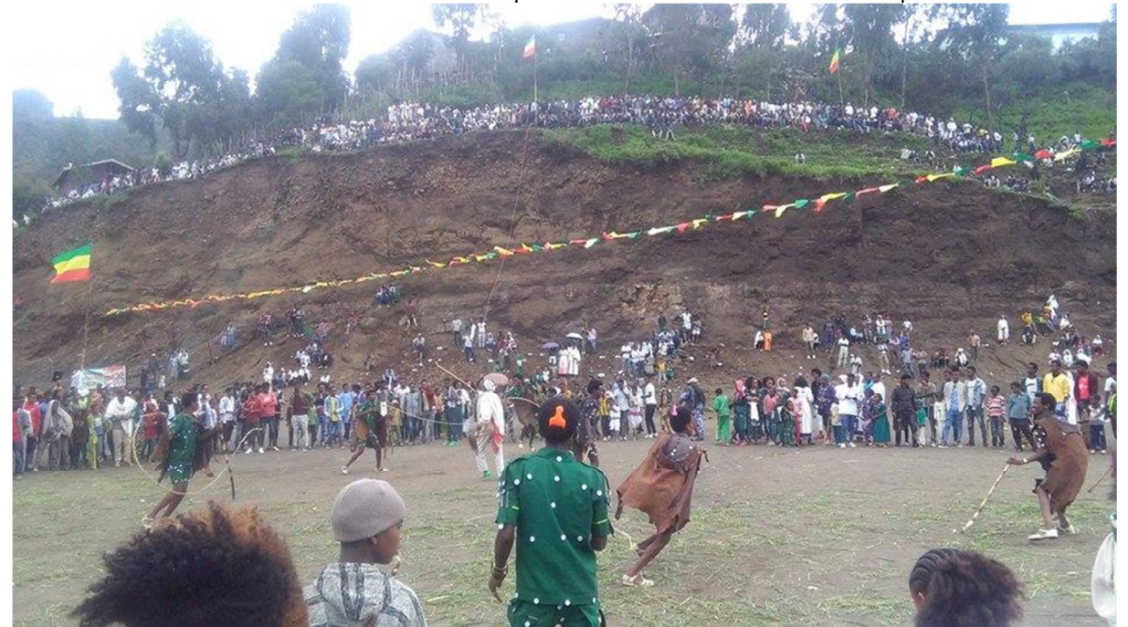
Figure 9: the risk of land slide which is the place of attending the festival due to lack of coordination among stakeholder

As most agreed that as a tourist destination site, Lalibela is not lucky through the integrations of tourism stakeholders to outshine its tourism products for the cultural tourism development.