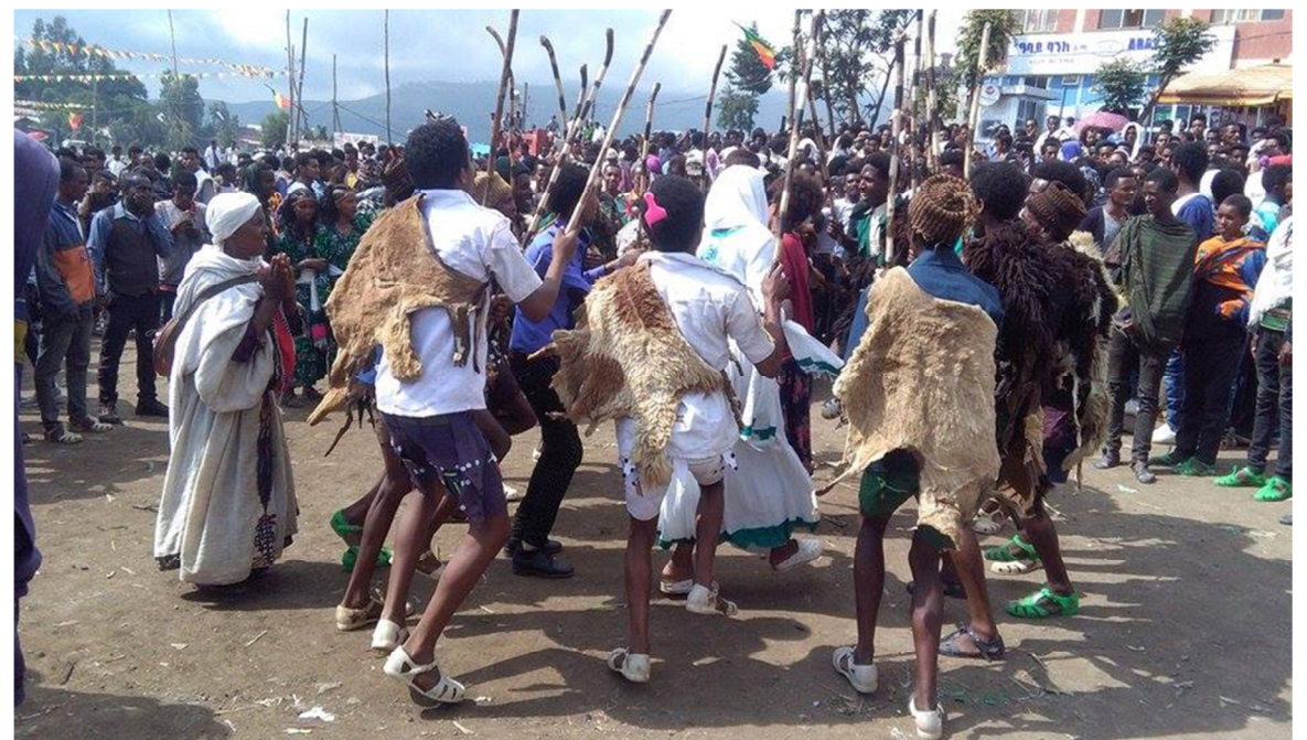
Figure 4: traditional music at Ashendye festival