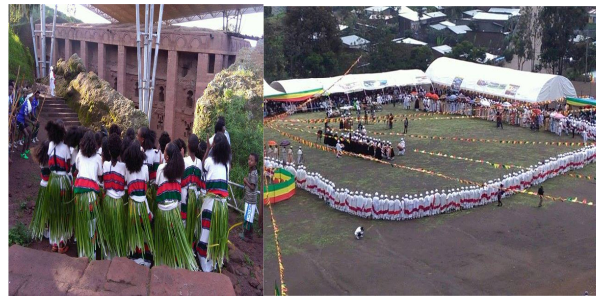
Figure 5: the left, Ashendye girls are starting the festival by celebrating at Bete Medihanlealm rock hewn church and the right; church clergies provide religious service regarding the festival