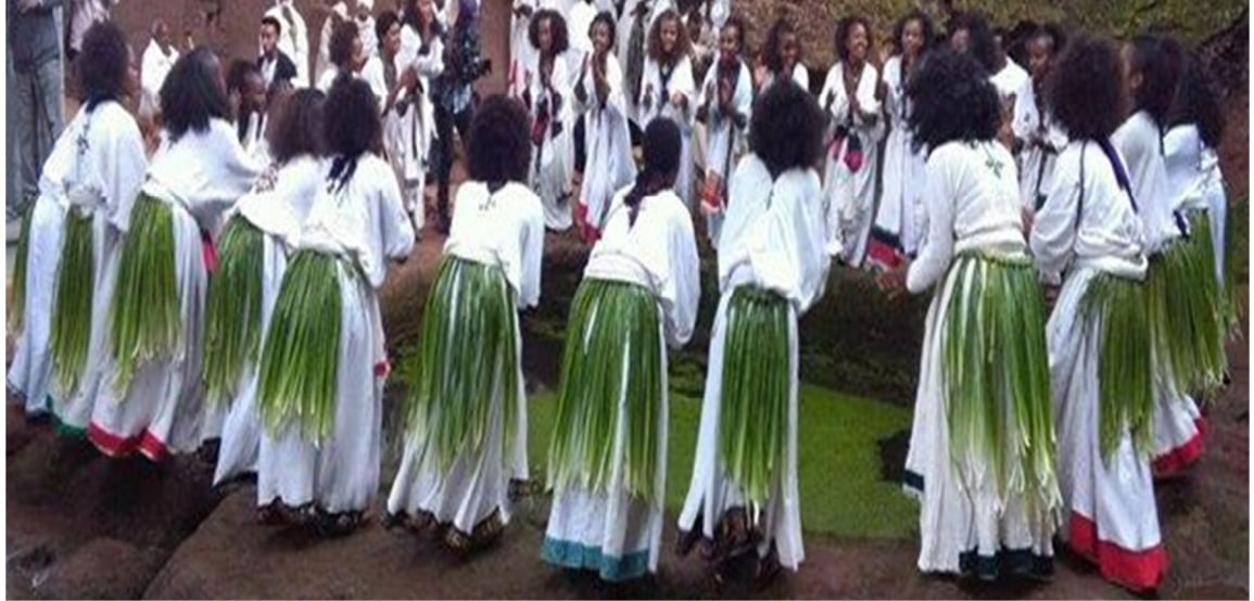
Figure 2: leaf gained naturally from the local environment

There is no naturally green environment means we are going to lose the basic symbols of Ashendye festival.