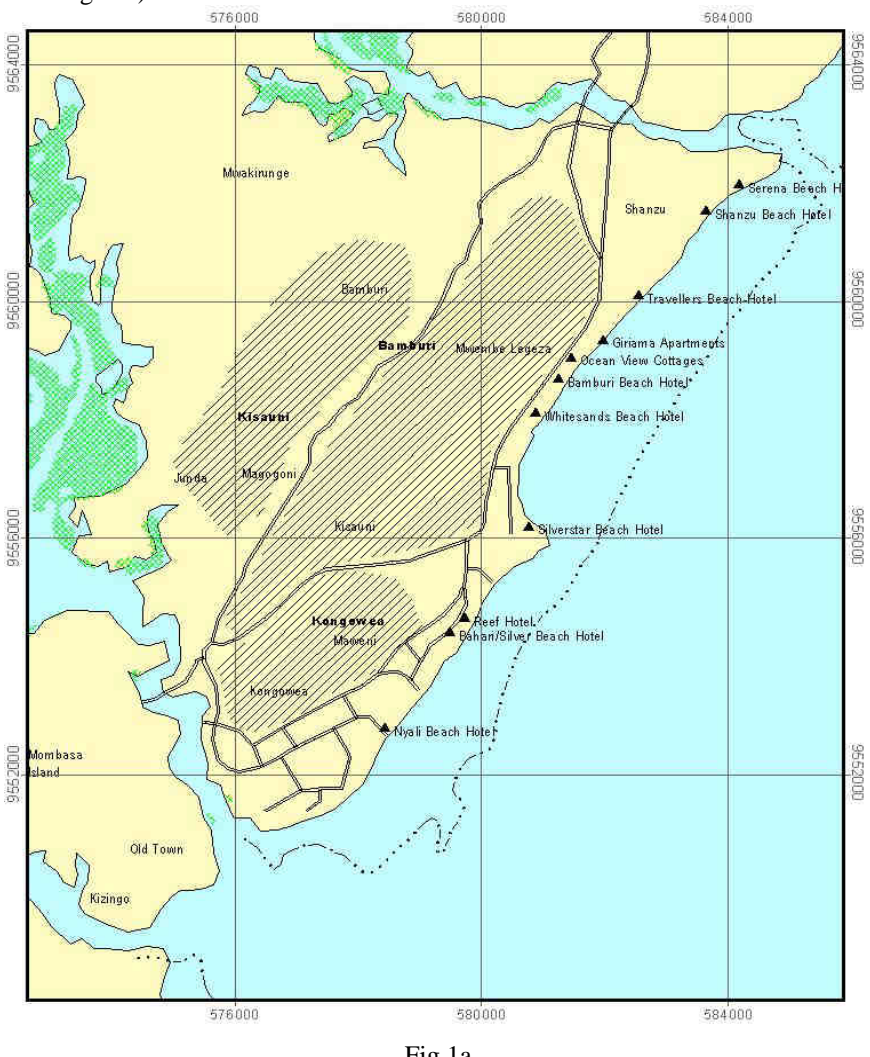
Fig.1a Kisauni, Mombasa

Figure 1: Spread and Location of Human Settlements and Beach Hotels (place the figure number and title at the bottom of the figures)