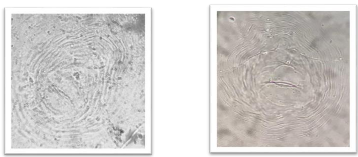
Figure 2. Photos of the perineal preparations of Meloidogyne incogniata (left) and Meloidogyne javanica (right) obtained from female root-knot nematodes

In laboratory studies, perineal preparations made using female root-knot nematodes detected in tomato roots were photographed under advanced microscope. (Figure 2). Morphological diagnosis of nematodes was made as a result of the examination of the photographs of permanent perineal preparations. Accordingly, only M. incognita species were found in the roots of grafted tomato plants in both years. In the roots of non-grafted tomato plants, both M. incognita and M. javanica species were detected.