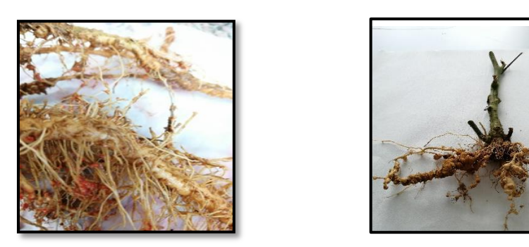
Figure 1. An infected root sample stained with red food coloring (left) and unstained infected root sample (right)

In laboratory studies, perineal preparations made using female root-knot nematodes detected in tomato roots were photographed under advanced microscope. (Figure 2). Morphological diagnosis of nematodes was made as a result of the examination of the photographs of permanent perineal preparations. Accordingly, only M. incognita species were found in the roots of grafted tomato plants in both years. In the roots of non-grafted tomato plants, both M. incognita and M. javanica species were detected.