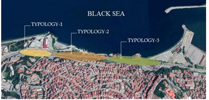
Figure 2. Road typologies in the study area

The plants used for road plantation (Table 3) within the scope of 3 different road typologies (Figure 2, Table 2) related with the 1.2 km section of Milli Egemenlik Street selected as the study area were evaluated aesthetically, ecologically and functionally within the scope of streetscape. The green band separating the vehicle road from the walkway, plant use on the walkway and refuge plantation were taken into consideration for the study area within the scope of streetscape. The areas limiting the width of the road outside the vehicle road and walkway width were not taken into consideration for Milli Egemenlik Street.