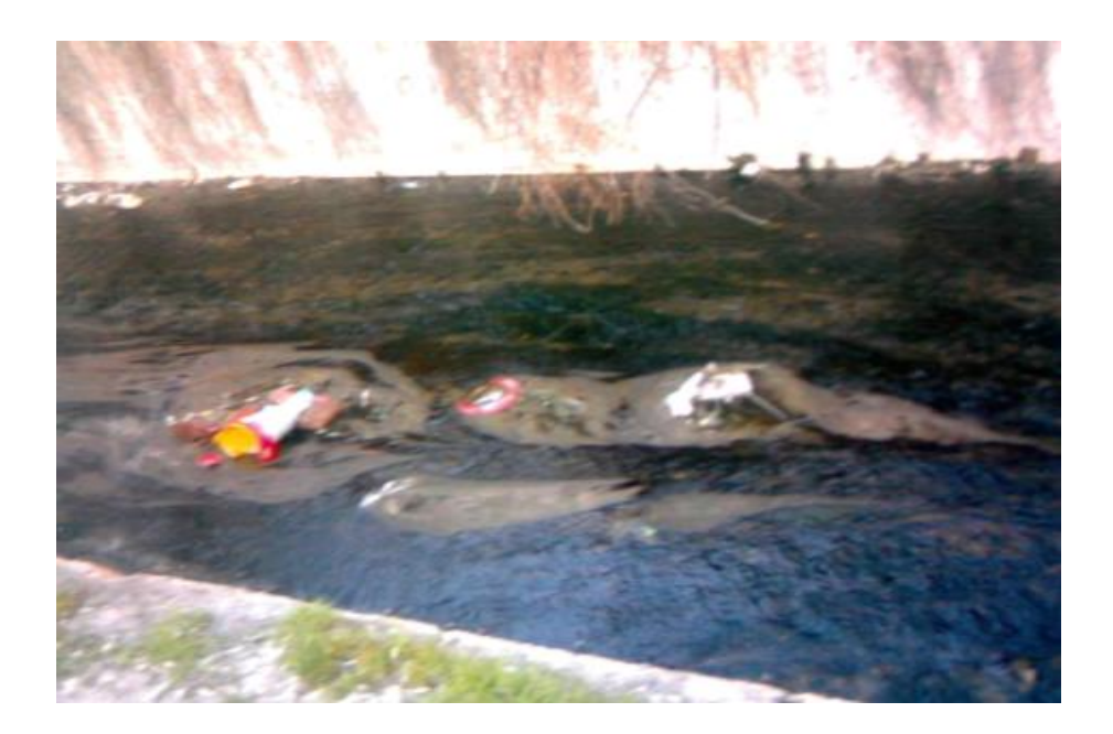
Figure: 2 Some plants that are in contact with the water in Kılıçözü Creek decrease pollution slightly however they are also affected from pollution in conclusion.