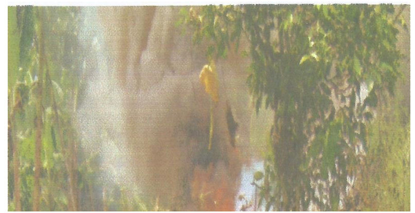
Figure 2: Partial View of Slash and Burn in Bonakanda