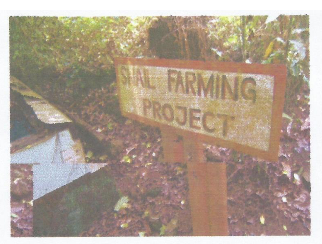
Figure 5: Snail Project in Bonakanda

The result from the Chi Square analysis shows that the modes of exploitation of land by farmers strongly affect the environment. This result is statistically significant at 1% given the asymptotic significance (0.000) which indicates that the calculated value of Chi Square (35.504) is far greater than the critical value of chi square at 5% and 8 degree of freedom (15.51).