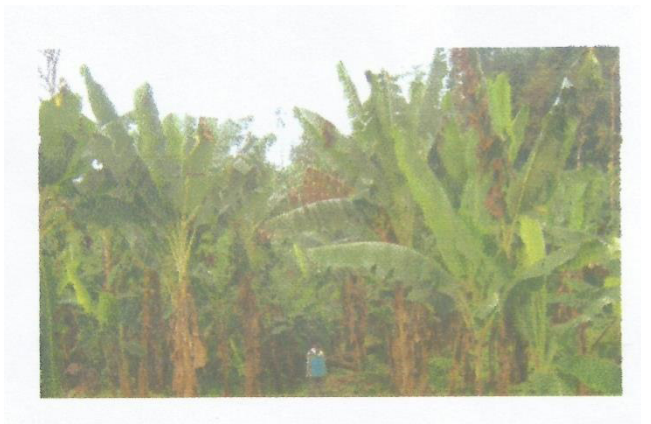
Figure3: Plantain Plantation at Woteva

Field survey showed that the income generation system in the villages incorporate multiple cropping and greater activity diversity. In fact income generation activities in these villages include the cultivation of yarns, bananaplantain, vegetables, spices, cocoa, coffee; bee farming, hunting, snail farming and pig farming.