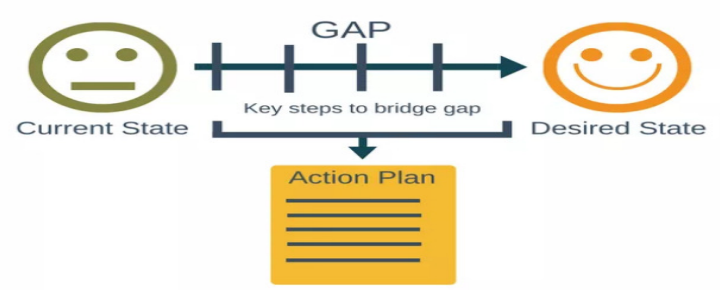
Figure 2: Schematic of Gap Analysis

For monitoring and controlling the efficiency of Human Resource Allocation, there should be a statistical view and analysis that not provide measured records but also kept up to date (Ridder and Baluch, 2017). A gap analysis is defined as the comparison of actual value with expected value (Lee, 2017). It is obvious that gap analysis is included in the controlling phase of five process. The data and information has been extracted from planning and results in executions.