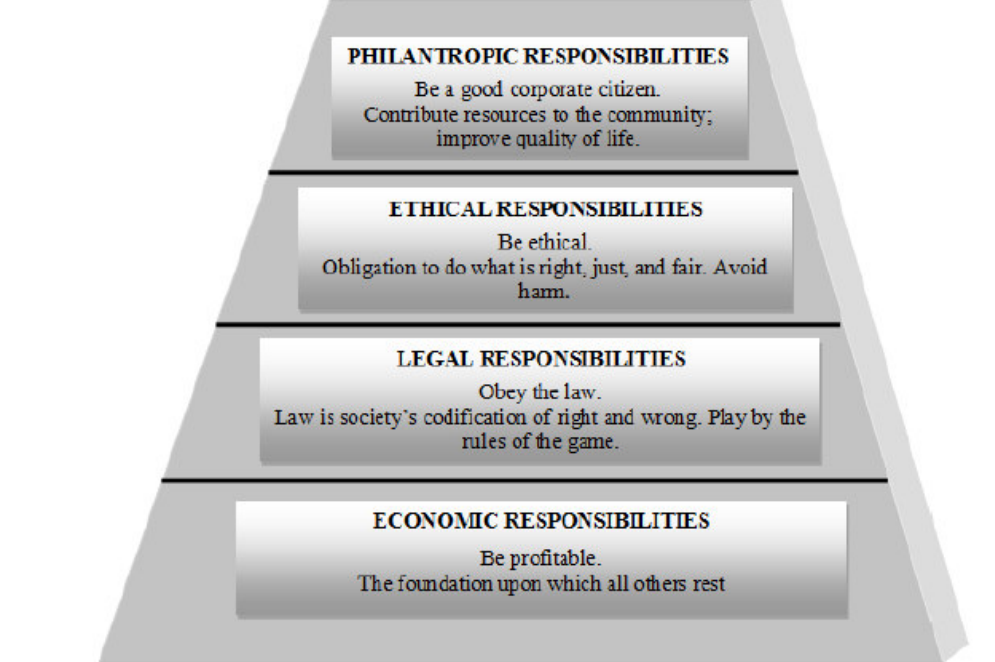
Source: Carroll, A 1991, "The pyramid of corporate social responsibility": Toward the moral management of organizational stakeholders.

Fig 2.2 The Pyramid of Corporate Social Responsibility