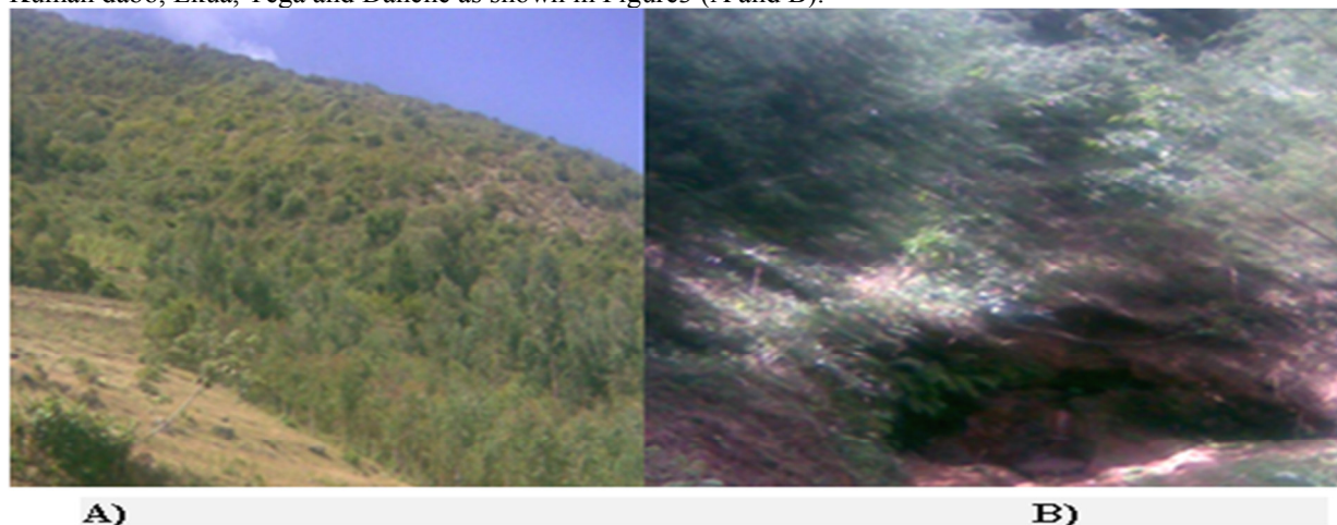
Figure3: Rehabilitated degraded forest land (A) and one of the springs emerged after the rehabilitation (B) near Mount Damota carbon sequestration forest site.

Environmentally, in the household survey conducted around carbon forestry project of Mount Damota in Southern Ethiopia, about 76.03% respondents indicated as the conditions of their environment are getting improved after the implementation of the project (Belete, 2014). Regarding the perceived environmental improvements, the key informants also mentioned some wild animals those started to enter to the rehabilitated forest area like Hyna, Moneky, Ape, Rabbit, Fox, Tiger and different species of Birds. They also added about the improvements of the rehabilitation on availability of water by naming some of the springs that emerged from rehabilitated forest which included Diguna, Weselemo, Balgubasa, Atekusa, Mengesha mena, Mena gedebio, Kuman dabo, Ekuu, Tega and Danche as shown in Figure3 (A and B).