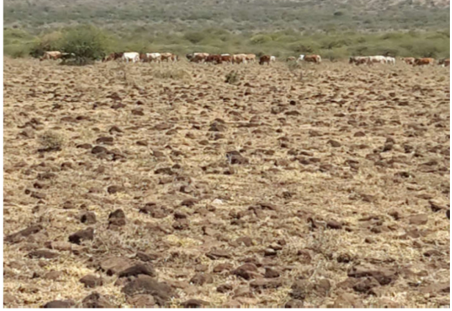
Fig.8 Habitat Destruction

These natural forest and wood lands are the habitats of important large and small animals. In NSNP, we found different animals: Zebra, Grant's Gazelle, Kudu and Lion. Despite to home services, the provision of food and water for these animals and birds is the other extreme importance of the forest and wood land (Lemlem and Fasil, 2006). However their habitat is currently being destroyed by the over-grazing of the cattle and deforestation for different purposes (Desallegn, 2004; Freeman, 2006&NSNP report, 2010 cited in Samson, et al., 2010).