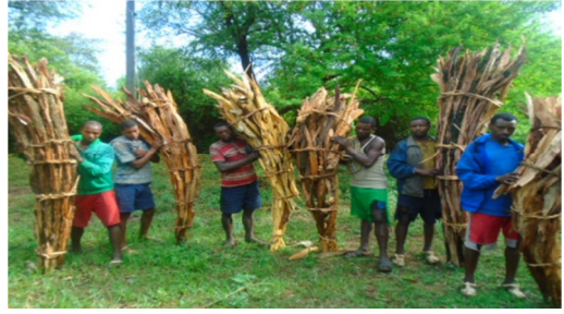
B. illegal charcoal production controlled by scouts