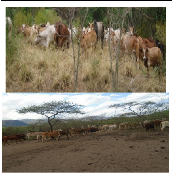
Fig.5 Encroachment of grazing land to forest areas