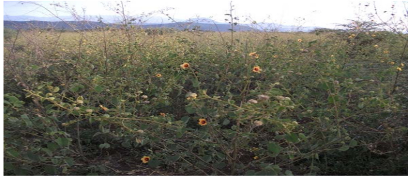
Fig. 7 widespread invasive species in the Nech Sar grassland plains ©Schubert, (2015).

While deforestation, overgrazing and over utilization of resources undertake on fragile ecosystems coupled with the current climate change, fertile grounds will be created for easily spread of invasive species which totally distress and dominate the existed ecosystem. Currently, there are many invasive species that are increasingly spreading around NSNP which have influence on the sustainable use and conservations of the park. Conservation of the natural ecosystems is the primary means to control the expansion of invasive species and regulating the ecosystem dynamics.