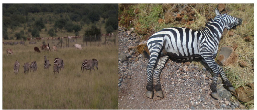
Fig. 9 sharing of grazing land between the wild and domestic animals (left) and death of zebra by transmitted diseases (right) Measures being taken by the Stakeholders

Currently, the Ethiopian government in general and the administration of the park have taken remarkable steps to address the current destruction of the park and control the impacts of investment projects and local community on the natural resources of NSNP. For example, environmental institutions are established from federal, to local level and Environmental issues including protected areas incorporated in the 1995 constitution of the country; articles 44 and 92 can exemplify the fact. In addition, for the sustainable use and protection of biodiversity the government has made different policies, strategies, laws, guidelines and proclamations. It has also engaged in working with other countries and NGOs and adaption of different international Conventions that have relation with biodiversity and environmental protection.