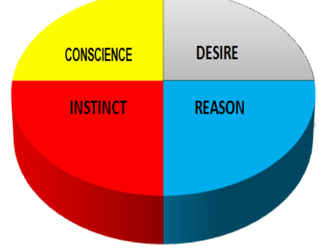
Diagram 3: the ideal type of the human personality meassured with Bele Quadrant