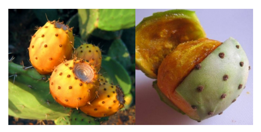
Figure 1: Prickly pear (Opuntia ficus indica L.)

For analysis, triplicate determinations were performed on each sample; data shown later represent the means of three measurements.