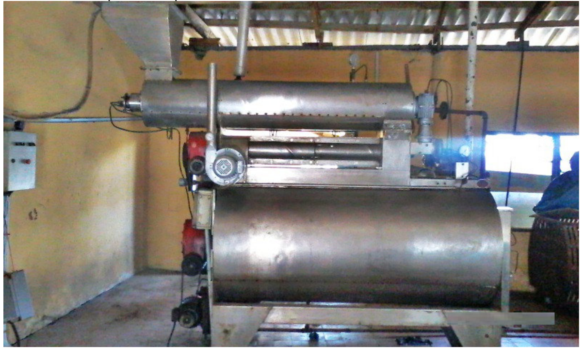
Plate 1: Compact Fishmeal Processing Plant (Denmark, type FR100)

milled de-boned tilapia fishmeal powder.