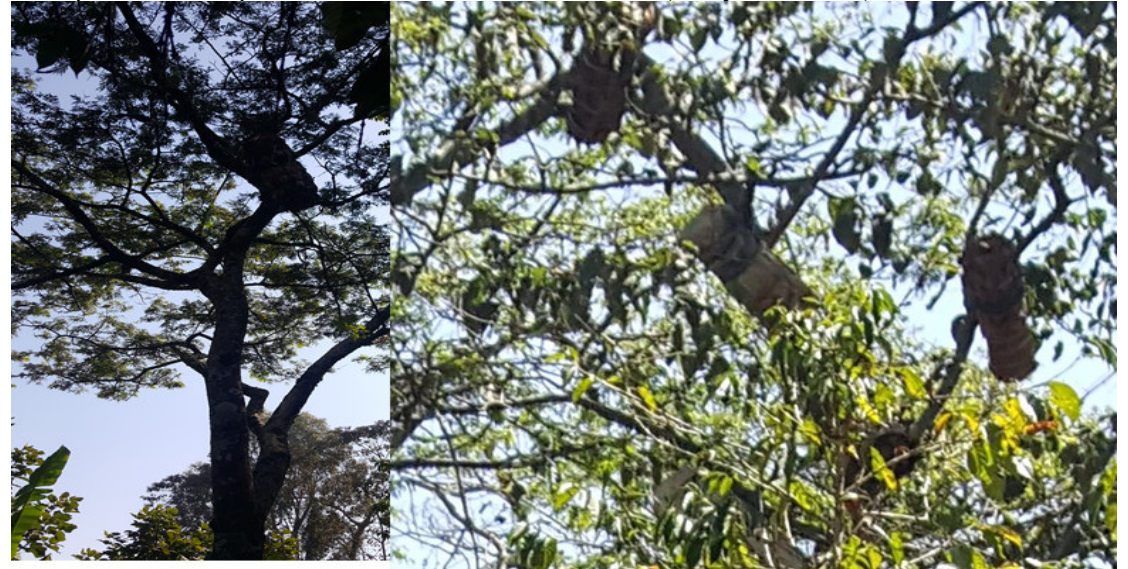
Figure 2. Traditional bee hives hanged on Acacia spp. (left) and Albizia schimperiana (right) in agroforestry system in Jimma zone

Trees components in agroforestry are also contribute to food security in Africa in the face of climate variability and change by providing environmental and social benefits as part of farming livelihoods (Mbow et al. , 2014). The amount of shade cover play direct role in mitigation of variability in microclimate and soil moisture