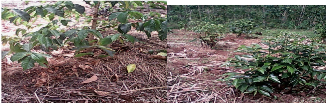
Figure2. Coffee mulching in the study area

Mulching enhances soil moisture status through improved infiltration, farmers of the area practices this by using the grasses which grown within coffee field they apply mulch at the beginning of a rainy season in order to aid infiltration, rather than at the end of the rains to reduce the rate of drying out during the following dry season this is in agreement with the study of (Pereira and Jones, 1954) showed mulching alternate rows before the rains gave better yields than mulching all rows after the rains.