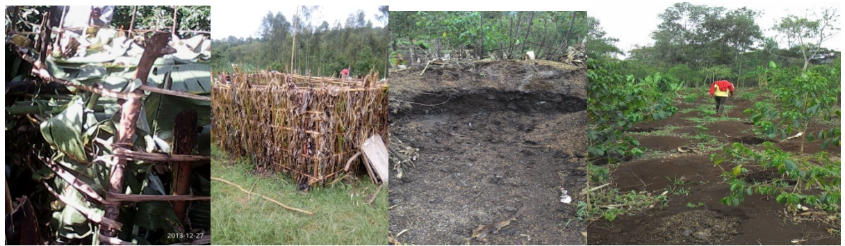
Figure3. Organic fertilizer (compost) preparation and application in study area

Both organic and chemical fertilizers are used in coffee farming in most coffee producing country, but in case of Ethiopia not yet used inorganic fertilizer, Gedeo's farmers produce organic coffee mainly using organic fertilizers usually prepared by mixing grasses, crop residues and/or animal manure in compost. It has been proved beyond doubt that continuous use of inorganic fertilizer in coffee makes the soil sick and this can result in a significant fall in the production levels (Anand .T and Geeta. N, 2004) which agree with the farmer of the study area.