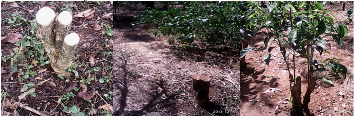
Figure 2. Pruning practices in the study area

Farmers of the study area adopt pruning practices because many coffee trees in the study area were aged, when the farmer prunes their coffee they obtain optimum yield within 2-3 years based on their management (Farmers witness in Wonago woreda).