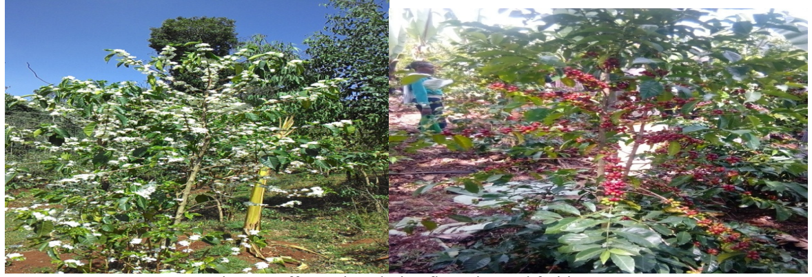
Figure: coffee variety during flowering and fruiting stage Gedeo farmers identify their traditional coffee variety by color of leaves, gross morphology of trees, weight

Surveys in main coffee growing woreda of the Zone showed that there is a high diversity of coffee variety. In Agro-forestry coffee systems and other cultivated coffee production systems, farmers choose the coffee types of their preferences and often mix more than one landrace within one field (Personal observation). Each has its own advantages. Some are high yielding, some have good aroma and flavor and some are resistant to diseases. A total of 8 dominant varieties known by all woreda in the zone.