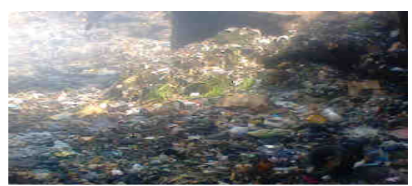
Figure 2a: Solid Waste at Gege Oloorun Ibadan South West L.G Figure 2b: Solid Waste at Oke Ado in Ibadan South West L.G