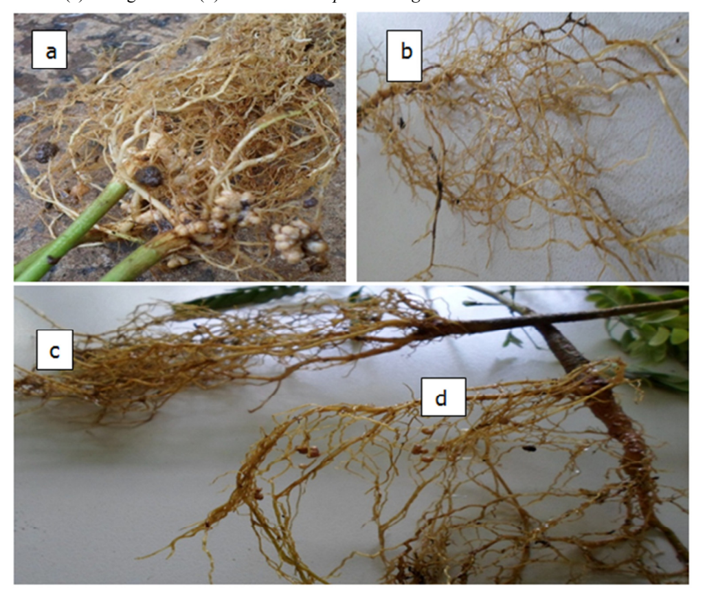
Plate 3: Tephrosia vogelii a treated plant with root nodules and b the control; Leucaena leucocephala d treated with nodules and c control plant.