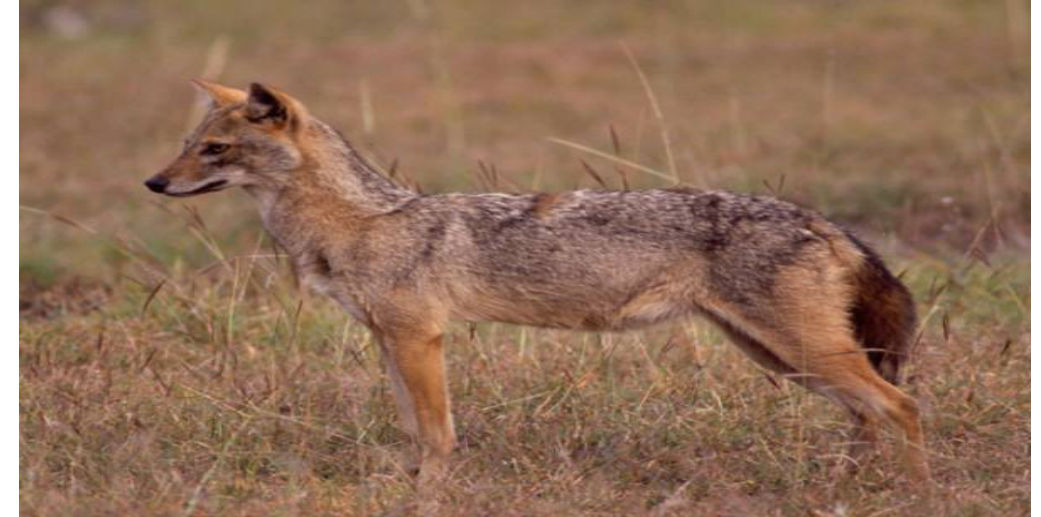
Figure 1: - Golden jackal (Macdonald, 1979; Moehlman, 1983)

(Key: HB = head and body measurement, T = tail length, HF = hind foot, E = ear, WT = weight)