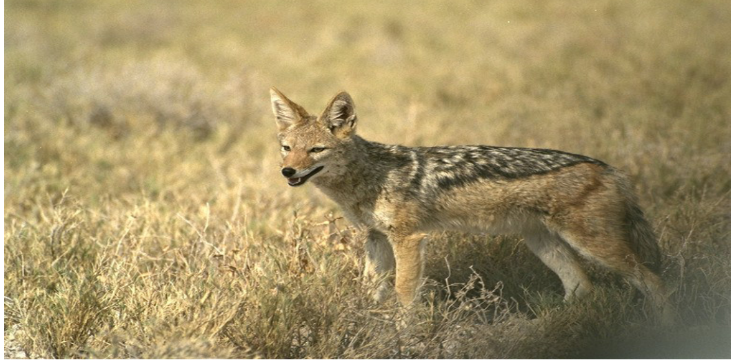
Figure 3: - The preferred habitat type of golden jackal (Sillero-Zubiri, 1996)

Golden jackals are habitat generalists. They are the most widely distributed of the three jackal species ( C. adustrus, C. mesomelas and C. aureus ). Their ranges are extensive and include many areas of Africa, Asia, and Europe (Macdonald and Sillero-Zubiri, 2004). This confirms the special adaptation of the species to heterogeneous environmental conditions and the efficiency they have in adapting diverse habitats, similar to the Coyote in North America (Bekoff and Gese, 2003). Due to their tolerance of dry habitats and their omnivorous diet, the golden jackal can live in a wide variety of habitats. These range from the Sahel desert to the evergreen forests of Myanmar and Thailand. They occupy semi-desert, short to medium grasslands and savannahs in Africa. Golden jackals are opportunistic and will venture into human habitation at night to feed on garbage. Jackals have been recorded at elevations of 3,800m in the Bale Mountains of Ethiopia (Sillero-Zubiri, 1996). Golden jackals prefer dry open country, arid short grasslands and steppe landscapes (Figure 3).