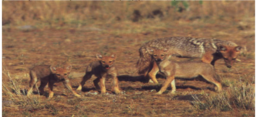
Figure 4: - pubs of golden jackal (Kingdon, 1977)

Dens may have 1–3 openings and typically are about 2–3m long and 0.5–1.0m deep. Young pups could be moved between 2–4 dens prior to joining their parents. In Tanzania, both parents and 'helpers' (offspring from previous litters) provision and guard the new pups. The male also feeds his mate during her pregnancy, and both the male and the 'helpers' provision the female during the period of lactation (Moehlman, 1983, 1986, 1989; Moehlman and Hofer, 1997). The 'helpers' are full siblings to the young pups that they are provisioning and guarding, and the presence of 'helpers' results in a higher pup survival (Figure 4) (Moehlman, 1986).