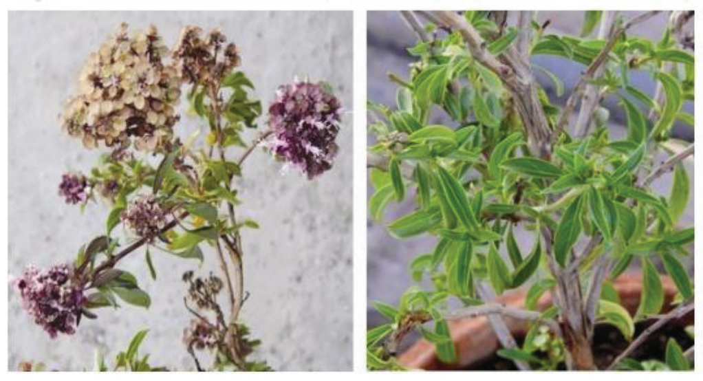
Figure 1: Aerial parts of Origanum majorana L.[4]

The genus Origanum (Oregano), an Important genus of the Lamiaceae family, is widespread throughout the world, comprosing about 900 species [3]. (Figure 1).