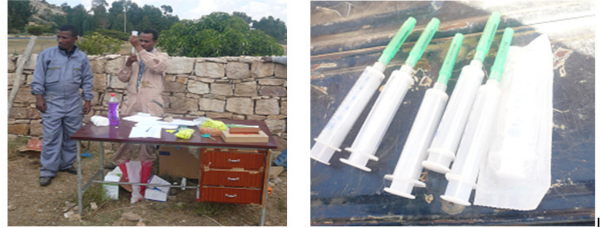
Figure 14. Prostaglandin Hormone dose preparation for dairy cow mass synchronization

The protocol for estrous synchronization was one injection of PGF2 \alpha (Lutalize) after the CL has been diagnosed using the rectal palpation method. A single dose of 5 ml PGF2 \alpha intramuscular injection in the hipbone muscle was given to cows and heifers not in heat within the last 5 days before hormone treatment using 10 ml syringe and 10 g needle PGF2 \alpha . (Fig 4). The day of PGF2 \alpha treatment was considered as day 0.