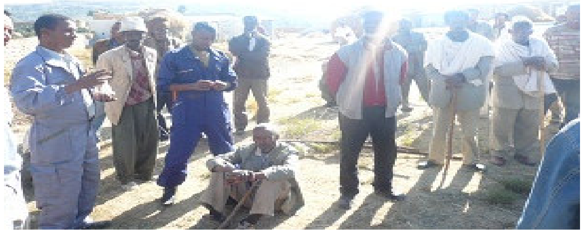
Figure 12. Community mobilization for making a sense of ownership of the project

Awareness creation on Artificial Insemination of the dairy cows with induced sign of estrus using Prostaglandin hormone was done with community for making a sense of ownership of the project (Fig. 2). The participant farmers were selected based on the following Criteria: Households with at least two cows/heifers, who have adequate feed resource, with experience in managing dairy animals and milk marketing were selected.