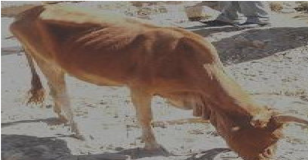
Figure 13. Local cow with poor Body condition (Score 1) rejected during screening

were from Holstein Friesian, local and their crossbreds. Age was estimation from the owner and using erupted permanent pair of incisors. 1<sup>st</sup>, 2<sup>nd</sup>, 3<sup>rd</sup> and 4<sup>th</sup> pairs of permanent incisors equivalent to an age groups of 27-32, 32-36, 40-44 and 47-54 months, respectively. Each of the presented cow and heifer were screened using Body Condition Score (BSC 1-9), parity and reproductive histories (Cyclic). Cyclic cow/heifer with BCS \geq 2 and second and above parity were selected for mass synchronization. About 30 cows and heifers were rejected during the screening stage due to poor body condition (Fig. 3) and reproductive and health problems. About 200 cows and heifers were checked for the presence functional CL and Diagnosed for detecting early-established pregnancy. Finally, about 199 cows and heifers with active CL were presented for hormone treatment and identified with ear tag.