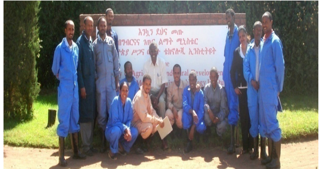
Figure 11. Technical team established for implementing mass estrus synchronization dairy cow in Tigray

A brief discussion was held with livestock experts, veterinarians, and AI technicians of the selected district to select potential peasant association and for logistic arrangement of the project. A technical team from researchers (3), veterinaries (2), and AI technicians (2) was established. Higher officials of ILRI at Ethiopia meat and milk development institute (EMMDTI) trained the technical team for a week (Fig. 1). After the training, the team handle the project and started the actual work, each steps of the technical team was followed up by the implementing organization and on the way the team gat a feedback from higher officials of the organization.