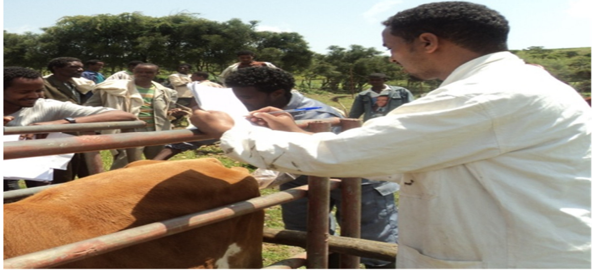
Figure 16. Data recording system during mass synchronization of the selected dairy cows

Age of the cow, body condition of the cow, parity, body weight, Corpuslutuem orientation, date and time of hormone treatment, date, and time of Estrus detection, Bull No., Date and time of insemination, pregnancy rate were recorded. Data were analyzed using SPSS version 16.0 commuter software using simple descriptive analysis such as mean and percentage.