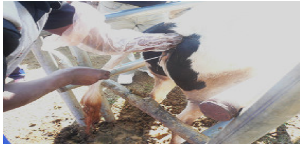
Figure 15. Mass Insemination of Prostaglandin treated cows and heifers

The systematic practice of artificial insemination after estrus synchronization is a technique that overcomes the problems associated with heat detection (Vounparet et al. , (2013).