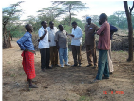
Plate 2: Naitongaa Farmers Field School.

It was observed that 4% of the local community members had migrated to other areas due to invasion of the weed since land is communally owned anyway. To cope with the thorn menace the locals wear special sandals made from old car tyres to protect their feet against injury (plate 2). Injuries caused by prosopis thorns are septic and cost of treatment is prohibitive a few have amputated limbs. Goats lose their teeth due to sugary pods which cause teeth decay hence animals starve to death. The local community sued the Government of Kenya for compensation.