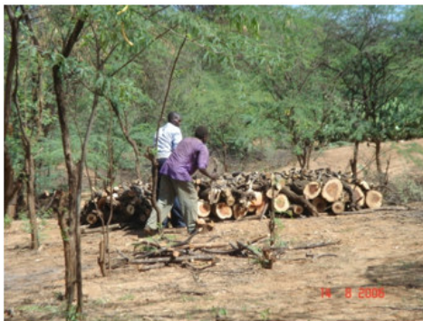
Plate 1: Preparing charcoal Kiln

From the population sampled 28 % mechanically uproot the seedlings especially around there homesteads to pave way for food crop production or settlement. A local NGO Rehabilitation of Arid Environments (RAE) has been encouraging locals to uproot Prosopis seedlings and plant Cenchrus ciliaris grass for their livestock but with little success. 22% of the population sampled prunes the prosopis trees, while 12.5 % collect Prosopis pods for sale to animal feed manufacturers like Unga feed limited and Nairobi millers. Animal feed manufacturers now prefer Prosopis pods to wheat straws and prams as an animal feed additive since it has high carbohydrate and amino acid content (Choge et al. 2002). Collecting of pods for sale as animal feed additive also has double effect of controlling available seeds for regeneration hence has the double effect of controlling the spread of invasion of Prosopis in the study area. The local communities interviewed do not use any chemical or biological control methods as used in South Africa and Australia. This is chiefly because chemical control is expensive and beyond the ordinary means of poor pastoralists of Salabani Location whose per capita income is below 1 dollar per day.