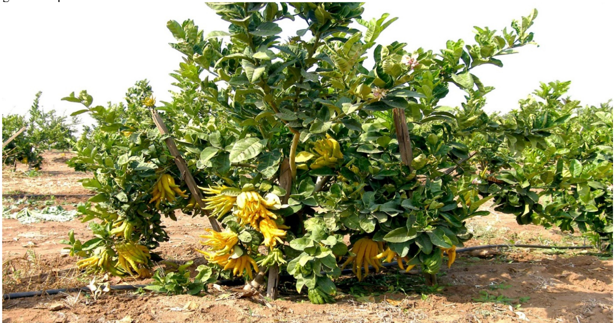
Figure (1) showed the tree of Al-Abbas's (AS) Hand fruit (Citrus medica) var. sarcodactylis Swingle.

The Al-Abbass (AS) Hand fruit ( Citrus medica ) is one of the three primordial citrus fruit (the others being pummelo and mandarine) from which most other citrus originated. It is an evergreen tree, ranging in height from 3 to 5 m, with fruit borne on thorny branches in 2-3 waves during the year. The tree is relatively short-lived (up to 15-18 years) and is sensitive to many insects and soil diseases, as well as to high and low temperatures (figure 1). Fruit range in size from 200 to 800 g, although they can grow much larger. Fruit attain their size while the peel is still green, and then ripen to yellow or even orange (figure 2). The oil yield was about 0.75% (4.55 g/500 g of fresh peel.