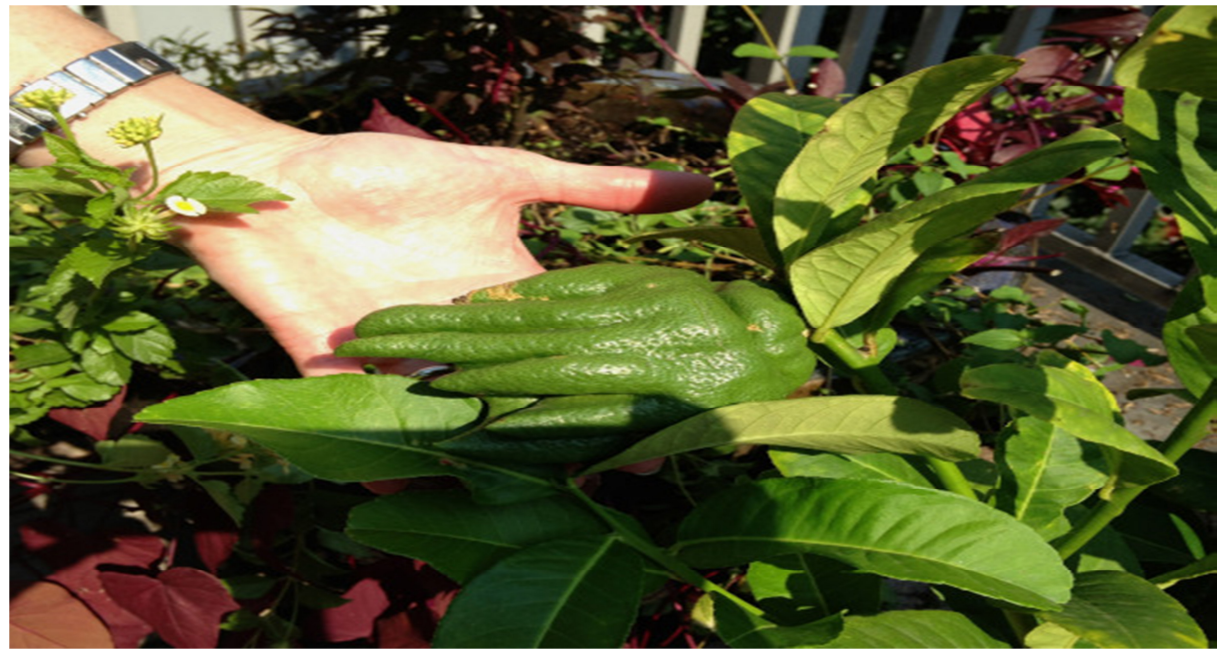
Figure (2) showed the shape Al-Abbas's (AS) Hand fruit (Citrus medica) var. sarcodactylis Swingle.

The data in Table (1) and Figure (3, 4, 5) shows that essential oils of Al-Abbas's (AS) Hand fruit ( Citrus medica ) var. sarcodactylis Swingle fruit peel has effective antibacterial activities on the test isolates as indicated by the diameter of their zone of inhibition. The inhibition zone was 18 mm for Enterobacter cloacae , 15 mm for Escherichia coli and Pseudomonas aeruginosa , 22 mm for Klebsiella pneumoniae , 20 mm for Proteus mirabilis , Bacillus sp. and Streptococcus spp. , 25 mm for Staphylococcus aureus .