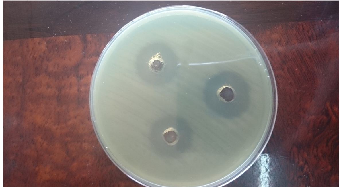
Figure (4). The antibacterial effect of essential oils of Al-Abbas's (AS) Hand fruit ( Citrus medica ) var. sarcodactylis Swingle fruit peel against Klebsiella pneumoniae.