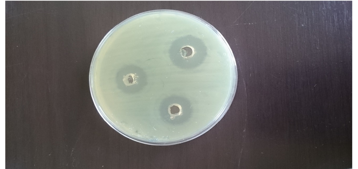
Figure (3). The antibacterial effect of essential oils of Al-Abbas's (AS) Hand fruit ( Citrus medica ) var. sarcodactylis Swingle fruit peel against Escherichia coli.