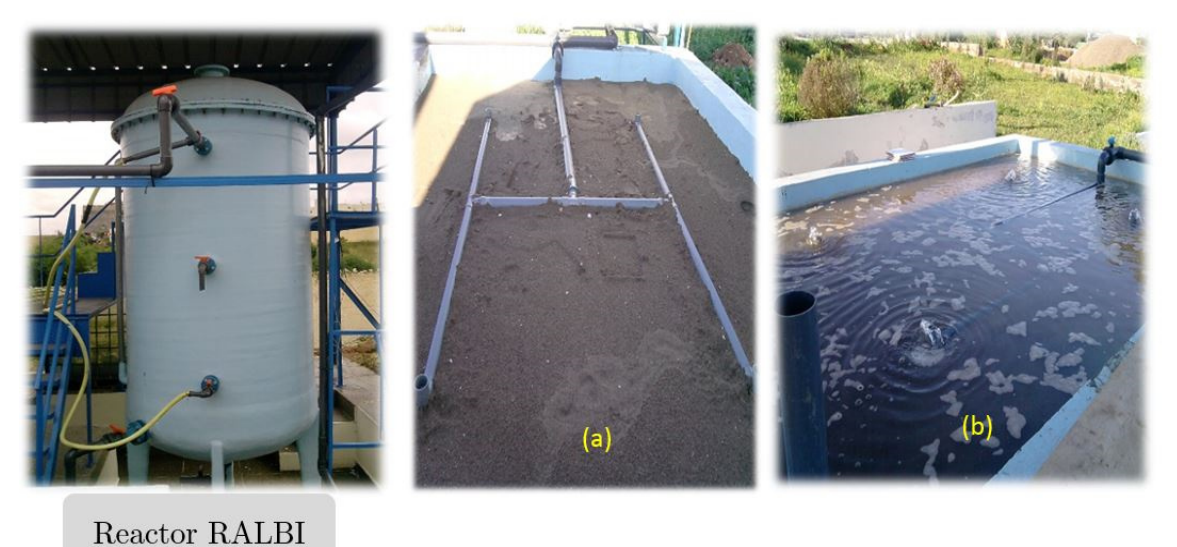
Figure 2. Reactor RALBI and Infiltration percolation basins (before filling (a) and after filling (b))