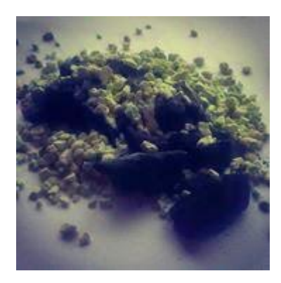
Figure 3. Mix of shungite and zeolite