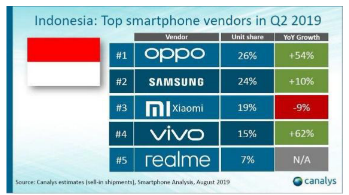
Figure 3. Top Smartphone Vendors in Q2 2019