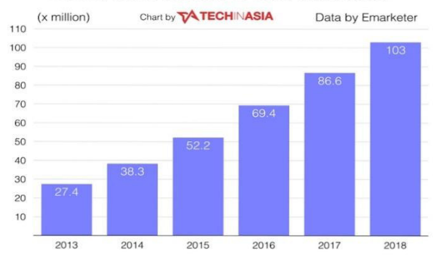
Figure 1. The number of smartphone users from 2013 to 2018