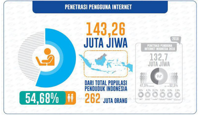
Figure 2. The penetration of Internet users in Indonesia

The marketing through the Internet can be considered similar to the direct marketing since the customers have direct relationship with the merchants despite that it is possible for the merchants to stay abroad. Based on the data released by the Association of Indonesian Internet Service Provider through the Survey of Internet Penetration and Internet User Behaviors in Indonesia 2017, it is found that half of the Indonesian population has already been connected to the Internet. According to the results of the survey, in 2017 approximately 143.26 million out of total 262 million Indonesian population have been connected to the Internet. This figure shows a significant achievement compared to the same data that have been released in 2016, which state that the number of Internet users in Indonesia has been 132 million people.