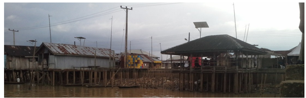
Plate A: Rain Water Floods in a Rural Settlement at Ogriagbene, Bomadi, Delta State