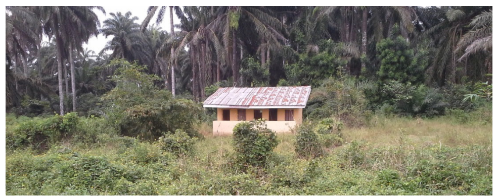
Plate B: Bushy Housing Environment at Edem Iyere, Ikono, Akwa Ibom State

Table 1. Percentage Distribution of Household by Type of Housing Tenure, 2010