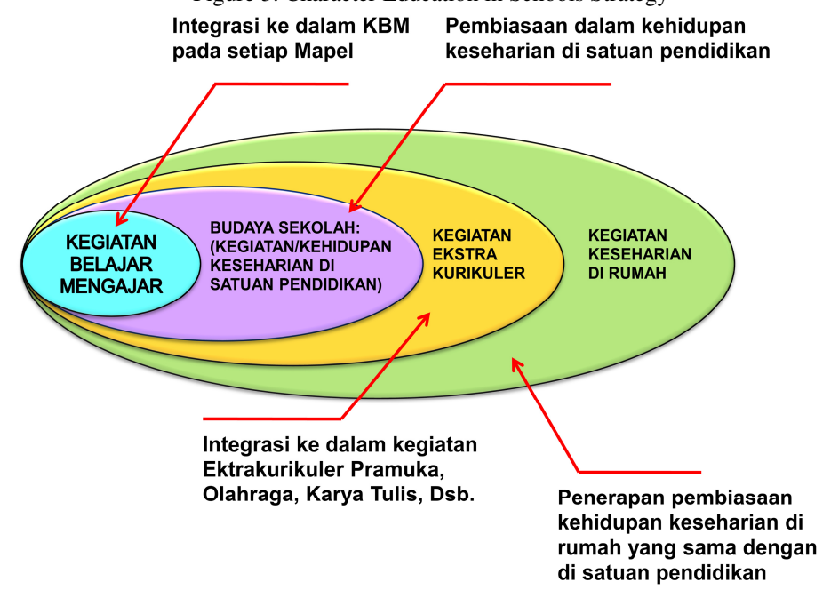
Figure 3. Character Education in Schools Strategy

Figure below shows the elements of the school culture is an important part of character education.