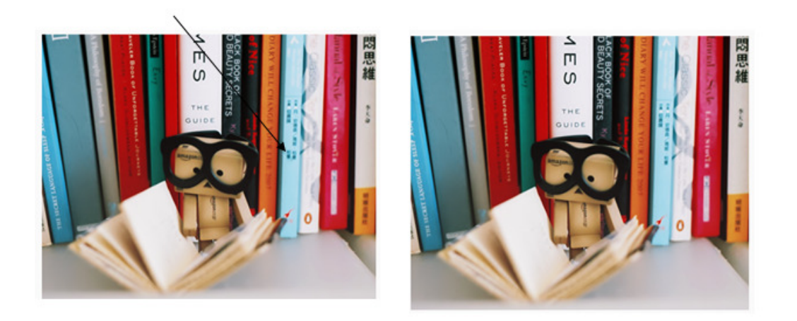
Figure (1) two identical images having only one difference.

Figure 2 shows the relation between histogram values and cfd of the points of images.