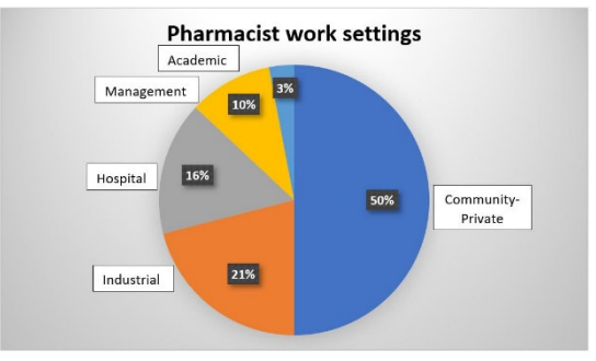
Figure No 1: Work settings.