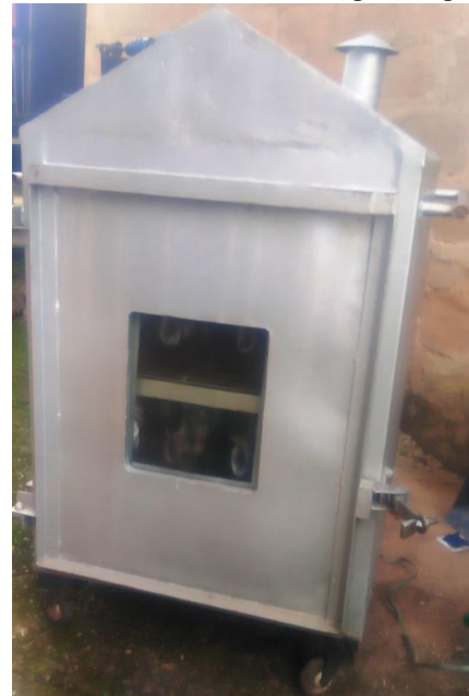
Figure 1: Pictorial View of the dualfired fish Dryer

steel plate for prevent ingress of contaminants and proper dispersion of flue gas. The required set temperature is done using a temperature controller mounted on the rear side of the dryer. Figures 1 and 2 show the pictorial and isometric views of the developed adaptable dual fired fish dryer while Table 1 shows its materials specifications