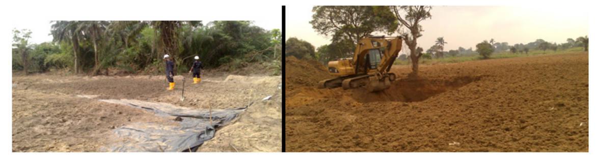
Plates 1 & 2 Land farming & Excavation in progress at one of the remediation sites in B-Dere, Ogoniland