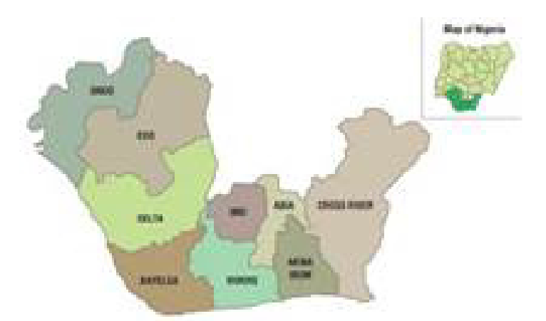
Fig 1: Map of the Niger Delta showing the component states

The Niger Delta is a unique ecological zone in Nigeria with an area covering approximately 70,000 km<sup>2</sup> and makes up 7.5% of Nigeria's land mass. It is politically made up of nine (9) states with some 31 million people of more than 40 ethnic groups and about 250 different dialects among which are: the Bini, and the Ogoni to mention but a few. It is estimated that about 70% of the region is rural and 30% urban. Poverty is prevalent as about 66% of the people earn less than US$ 75 per month. The region accounts for about 90% of national export earnings and 70% of Federal revenues, but with high level of poverty and Poor socio-economic and infrastructural development (Mmom, 2003).