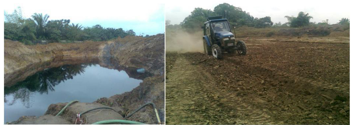
Plate 5: Deep excavated at the site.