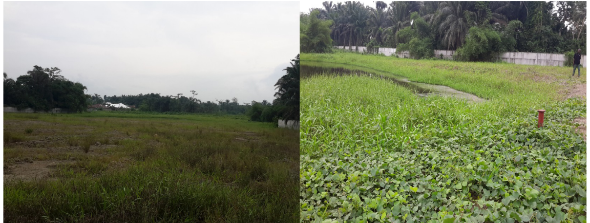
Plate: Extended View of Site. March 2014.

The remediation of Ejama Ebubu is a clear demonstration of effective partnership with host community which has earned the trust and mutual respect of all parties. It is also an expression dogged commitment and capability of SPDC to bring about environmental restoration of impacted areas within the Niger Delta, in particular where we have unfettered access and no recontamination. So far, between 2012 and 2013, SPDC has remediated 50 sites and 41 of these remediated sites have been certified by the regulatory agencies and independent verification teams in Nigeria (see fig.3) Serious work is on-going and it believed that by the end of 2014, additional total of 100 sites would have been remediated and at least 80 of such sites certified.