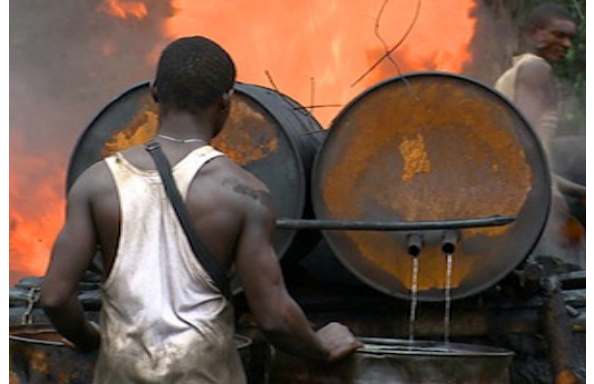
Plate 7: illegal refining activities Plate 8 : oil theft

The Shell Petroleum Development Company Limited through it Ogoni Restoration Project has made a lot visible commitment towards total restoration of Ogoni land. However, the success is being constrained by the myriads of problems confronting it. In the first instance, there has been the continuous challenge of increasing incidence of oil spillage and re-pollution of already remediated sites due to oil bunkering and artisanal crude oil refining activities. For instance, in 2013 scorecard, 50 contaminated sites were remediated and 47 new incidents were reported in SPDC's operational area. This is not a good omen for the restoration project as these incidences are on the increase daily. In other words, there is the challenge of stopping of sources of contamination occasioned by oil theft and illegal refining.