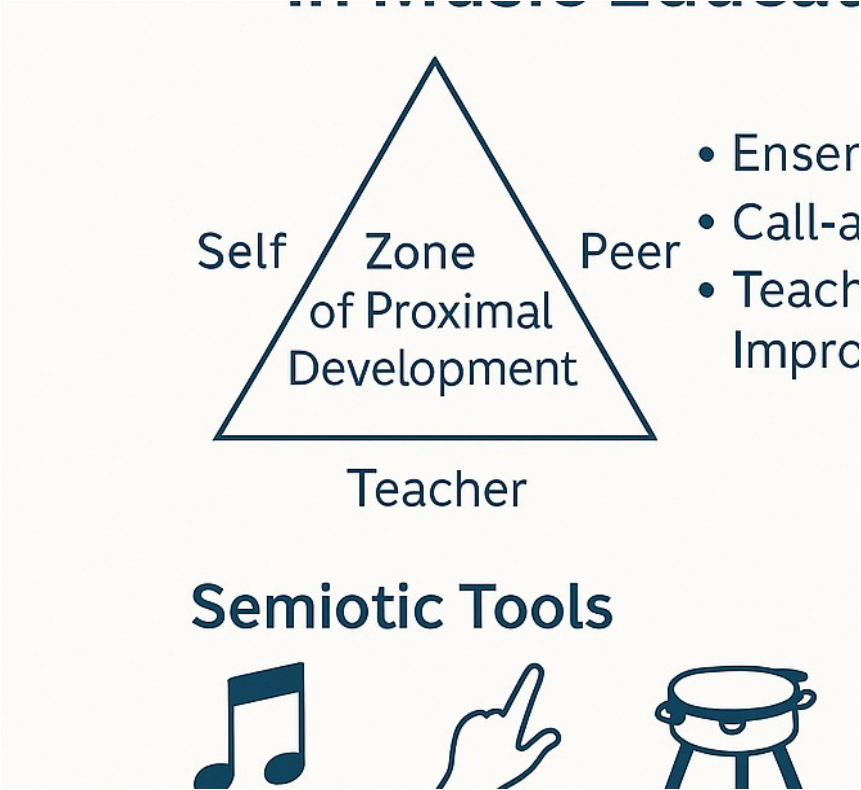
Figure 2: Vygotsky's Theory in Music Education