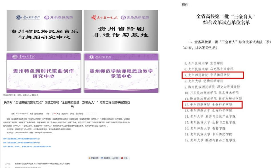
Figure 3: Display of Innovative Achievements in Party Building Integration and Innovation Cases

In recent years, the Party Committee of the college has created over 100 songs that showcase the new era and promote the main theme, as well as more than 50 dance works. These artistic endeavors strive to tell the Chinese story well and spread the Chinese voice. Among them, the dance work "Bengniu Fighting Horns" was nominated for the final round of the 12th China Dance Lotus Award and achieved the excellent result of being ranked 36th nationwide, making it the only work from Guizhou Province to reach the final round. The work that praises the "Model of the Times," "Call Out to Old Huang," won first prize in the music category of the Guizhou Arts Award and an award for fine works from the Ministry of Education, and was also performed on the CCTV special program for poverty alleviation.