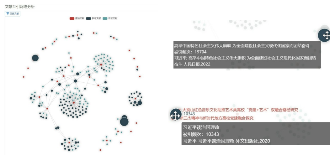
Figure 1: Network Analysis Report on the Mutual Reference of the Relevant Literature on "Party Building" in Art Universities and Professional Fields

core values and enhance the attraction and appeal of the party building work through the form of art. For example, "Dabie Mountain Red Music Culture boosts the Art Universities" and other articles are in-depth discussions on the road of integration and innovation of art and Party building on the basis of the above core documents.