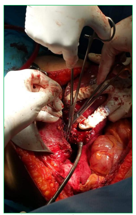
Figure 2. Resection of segments VI-VII.

After cholecystectomy is performed, the elements of the right hepatic artery are prepared, also the branch of the portal vein, which is gently grasped with a bulldog clamp. Getting back to the already luxated liver, we advance close to the vena cava, to identify, clamp and suture-ligate with prolene the right suprahepatic vein. Then the anterior segmental branch of right hepatic artery is ligated, which demarcates an ischemic zone of segments VI-VII and a narrow belt in segments VIII and V.