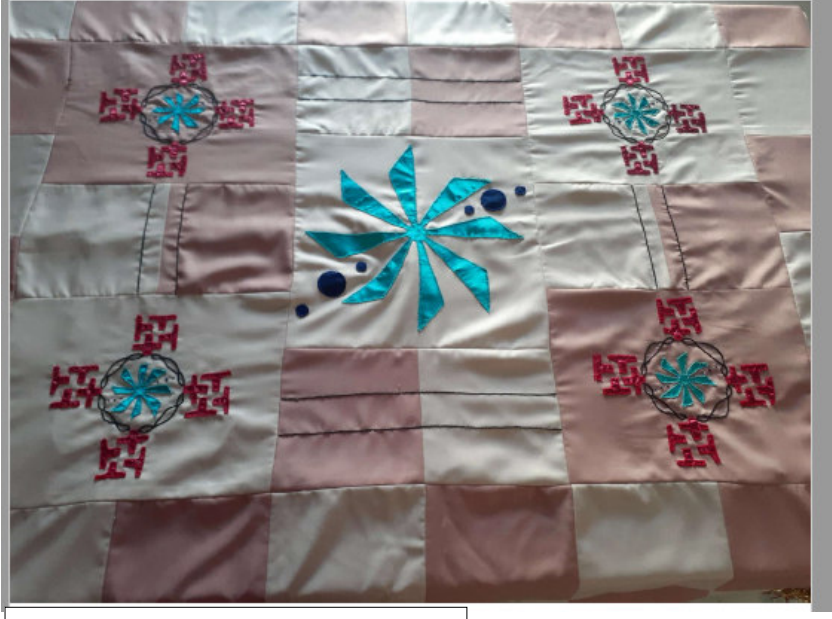
Figure 4. Tablecloth Craft Products

Picture 1 is the art of carving Gorga Naualu Village attached to the wall of a traditional Batak Toba house located in North Sumatra-Medan attached to the left and right corners. Gorga Naualu Village is a symbol of the eight cardinal directions, namely east, southeast, south, southwest, west, northwest, north, northeast. Ornaments have meaning for the Toba Batak people, where the Gorga Naualu symbol is associated with ritual activities, farming season, fishing season. So that this symbol is applied in the proverb for the Toba Batak community which is interpreted as every season that starts, it should be done immediately, don't delay it anymore. Because the direction of the wind continues to rotate, so if we are complacent it will result in losses in the field of time and sustenance.