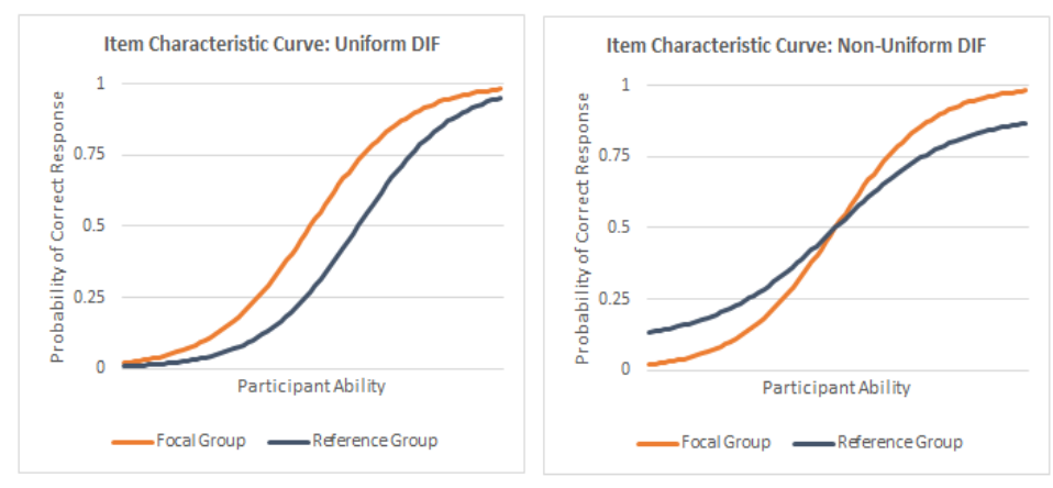
Figure 1. Item characteristic curves demonstrating of uniform and non-uniform DIF

Zumbo (1999) mentioned that there are two types of Differential Item Function: the uniform and non-uniform DIF. Uniform DIF appears when the probability of answering the item correctly is consistently higher in one group and across all levels of the ability; thus there is no interaction between the ability level and group membership. Whereas the non-uniform DIF appears when there is an interaction between the level of ability ( \theta ) and group membership; which mean that the pattern of differences in the probability of responding to the item is not the same at all levels of ability, so we find these differences are in favor of one group in a certain ability level, while it is in favor of another group in another ability level. Figure 1. Shows both uniform and non-uniform DIF.