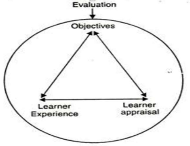
Figure 1. The three evaluation components (Figure created by author from the research of Disha, N.A) Ministries of education, departments of education, and school districts in any educational system can improve the quality of their educational programs at all levels in all subjects using an evaluation process (Al-Hazmi, 2003; Alnahdi, 2014). Al-Hazmi, (2003) and Alnahdi (2014) added that If teachers increase their evaluation skills and performance, they can serve their country and educate their children better.

Best practice for classroom teachers for all school subjects includes active and continuous involvement in the evaluation process. Classroom teachers pay attention to three components when they evaluate their students (Disha, N.A). First is the purpose of instruction indicated by the learning objectives - the "WHY". Second is the plan that describes the learner experiences to attain the learning objectives - the "HOW. Third is the practices which actually take place in the classroom- the "WHAT" or the learner appraisal. All three components need to be connected in order of the evaluation process occur in the taught subject.