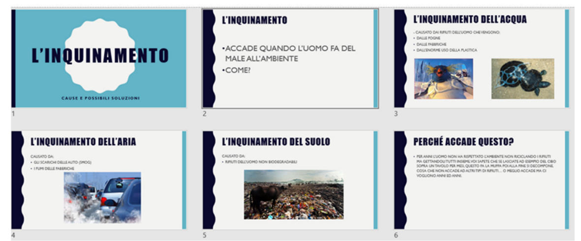
Figure 1. Powerpoint presentation of pollution (inquinamento) of water, air and soil, with final question about how this happens