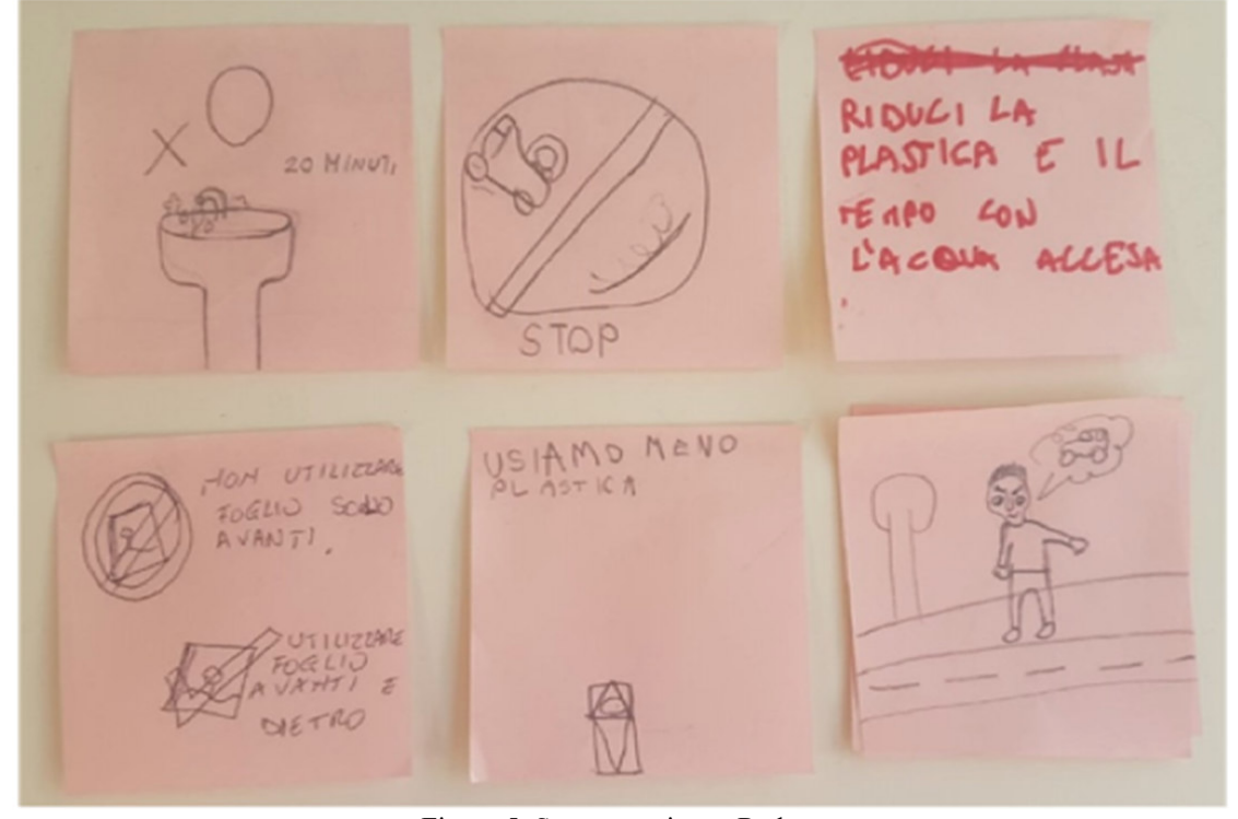
Figure 5. Some post-its on Reduce