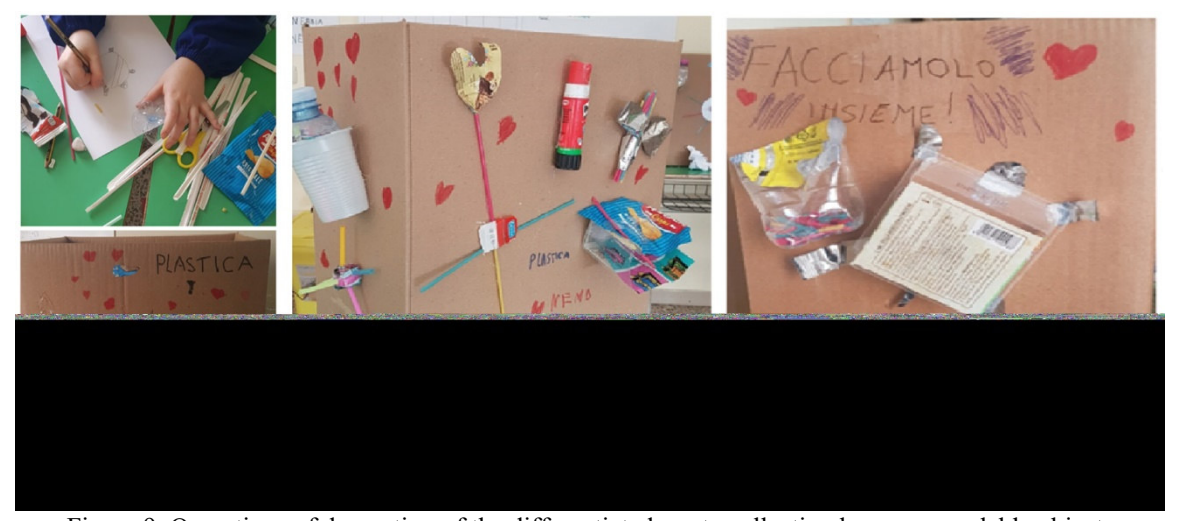
Figure 9. Operations of decoration of the differentiated waste collection by non-recyclable objects