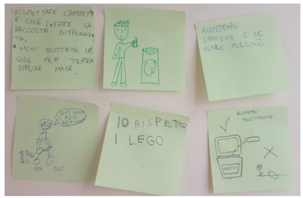
Figure 2. Some post-its on Respect and pollution