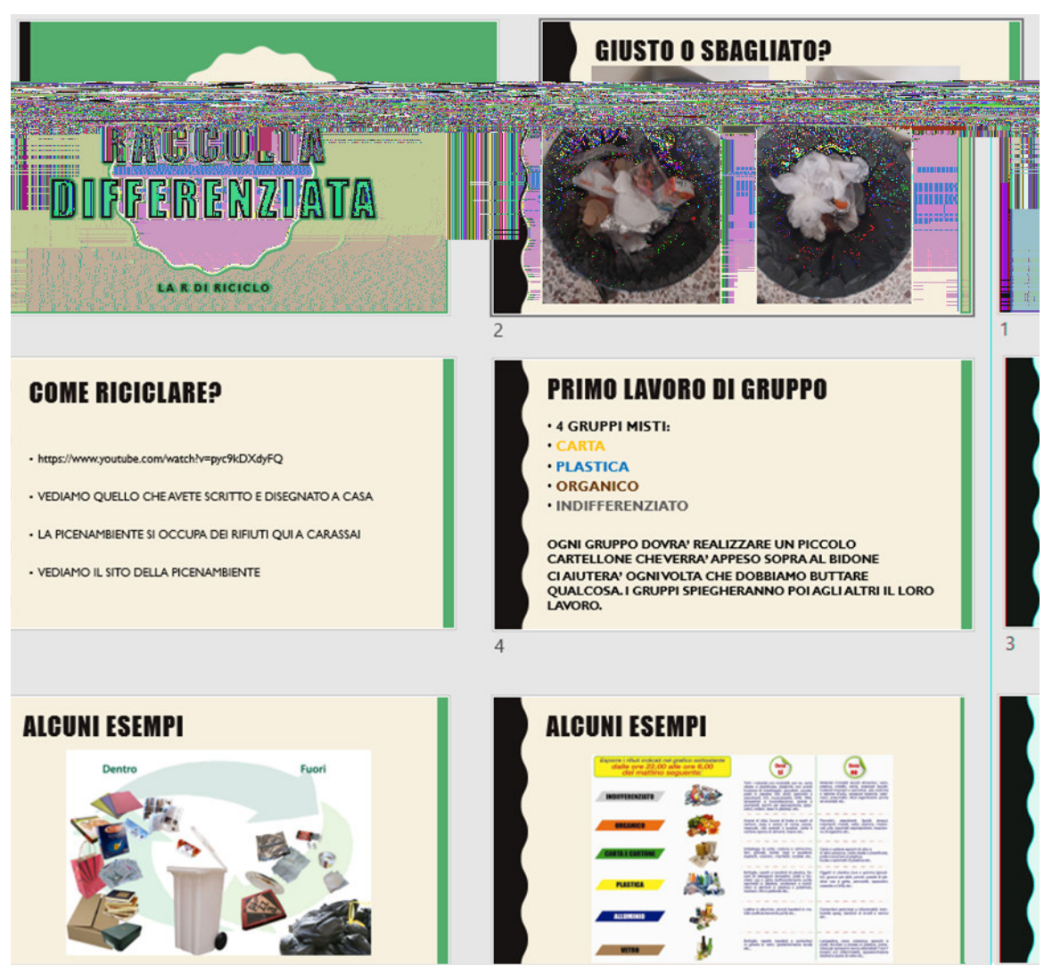
Figure 8. Powerpoint presentation of the local indications about differentiated waste collection and on the relevant work to be done at school