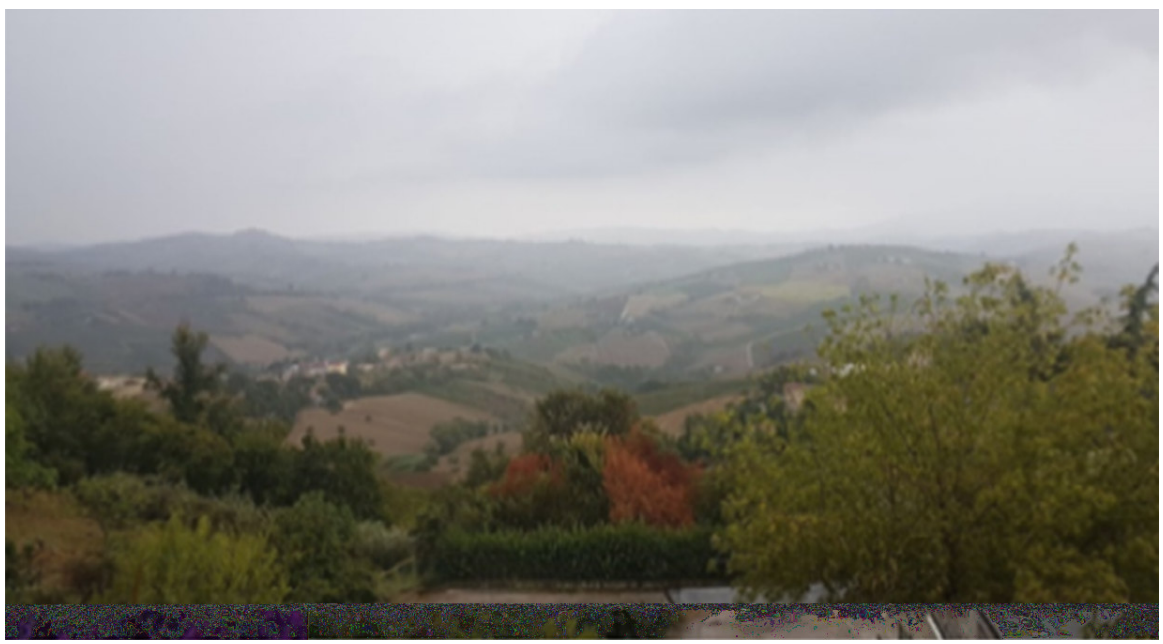
Figure 3. Landscape from the classroom window