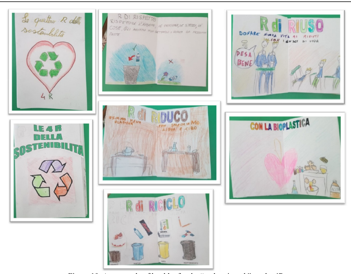
Figure 10. An example of booklet for the "authentic task" on the 4Rs