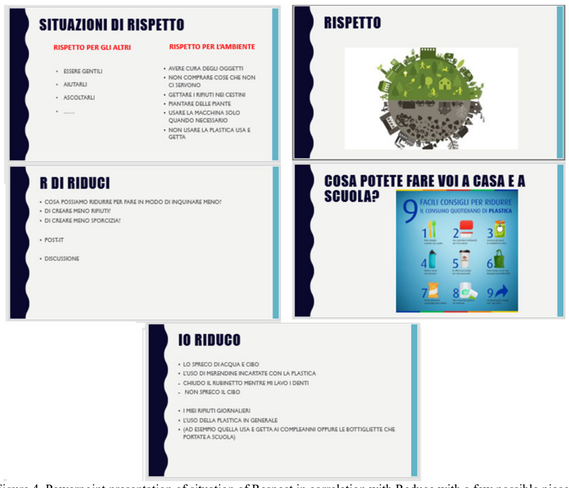
Figure 4. Powerpoint presentation of situation of Respect in correlation with Reduce with a few possible pieces of advice on good practices